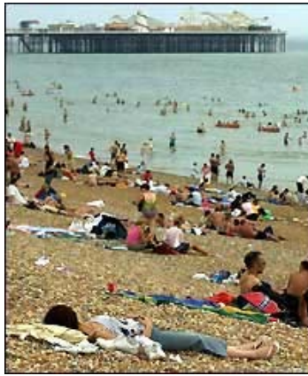
Brighton beach was crowded and chaotic

Brighton beaches were crowded and chaotic, with the sea front office saying: "There have been lots of lost children, pier jumpers, drunks and other shenanigans which we are dealing with."