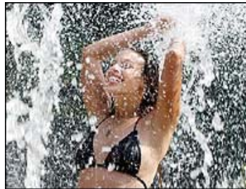
People used London's fountains to cool down

The record for the hottest day ever in Britain was broken on Sunday as temperatures soared to 38.1C (100.6F) in Gravesend, Kent.