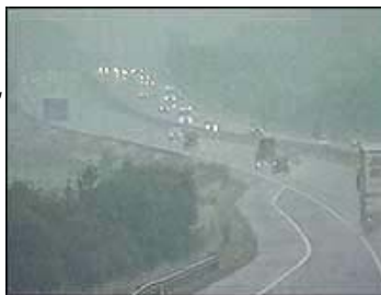
Not everybody in the UK enjoyed sunshine

"In the years to come, as the earth's atmosphere does heat up through global warming, we would expect to see these hot weather events happening with greater frequency," he said.