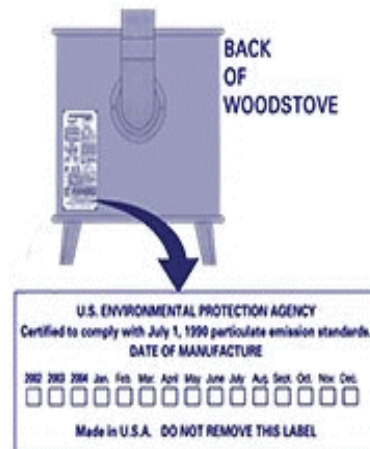
Permanent Wood Stove Label

Wood stoves offered for sale in the state of Washington must meet a particulate emissions limit of 4.5 grams per hour for non catalytic wood stoves and 2.5 grams per hour for catalytic wood stoves.