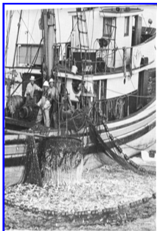
Brailing pelagic fish, two tons at a time, from seine net to