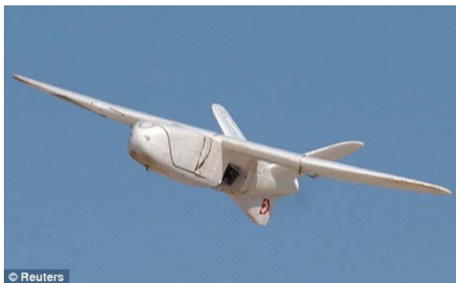
An unmanned drone, belonging to the Mexican government, crashed near El Paso. File picture

NTSB spokesman Keith Holloway said the drone was an Orbiter Mini UAV, operated by Aeronautics Defense Systems and owned by the Mexican government.