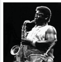
The Big Man, Much More Than a Sideman

Home | World | U.S. | N.Y. / Region | Business | Technology | Science | Health | Sports | Opinion | Arts | Style | Travel | Jobs | Real Estate | Autos | Site Map