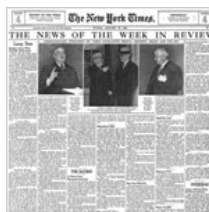
Next Sunday: The Latest Evolution of the Review