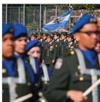
At Queens School, R.O.T.C.'s Influence