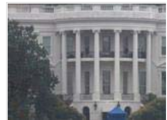
Bullet strikes White House window