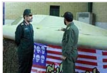
Iranian TV shows alleged U.S. drone