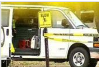
Man in Santa suit kills relatives