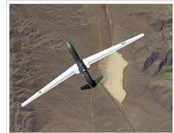
The Global Hawk's wings, fairings, nacelles, and tails are manufactured from high strength-to-weight ratio composites.

In September 2006, testing began on a new specialty radar system, the Multi-Platform Radar Technology Insertion Program, or MP-RTIP, onboard the Scaled Composites Proteus. Once validated, one Global Hawk will be modified to carry this radar set. Previously, the Air Force was considering a larger variant of the MP-RTIP (known as the Wide-Area Surveillance or WAS sensor) for the cancelled E-10 MC2A testbed or E-8 Joint STARS aircraft.