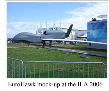
EuroHawk mock-up at the ILA 2006

The aircraft is based on the Block 20/30/40 RQ-4B, but will be equipped with EADS' SIGINT package to fulfil Germany's desire to replace their aging Dassault-Breguet Atlantique electronic surveillance aircraft. [50] That sensor package comes in the form of six wing mounted pods, a first for the Global Hawk. The EuroHawk was officially rolled out on October 8, 2009 and first flight took place on June 29, 2010. [51] It underwent several months of flight testing at Edwards Air Force Base before flying to Germany. [52] On July 21, 2011, the first EuroHawk arrived in Manching, Germany where it will be equipped with the SIGINT sensor package. There it is also slated to undergo more testing and pilot training, until the first quarter of 2012, when it will be officially handed over to the Luftwaffe to be stationed with the Reconnaissance Wing 51. [53]