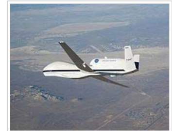
A NASA Global Hawk in flight