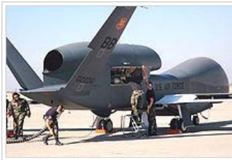
A maintenance crew prepares a Global Hawk for a test at Beale Air Force Base

In an unusual move, the aircraft entered initial low-rate production while still in engineering and manufacturing development. Nine production Block 10 aircraft (sometimes referred to as RQ-4A configuration) were produced, two of which were sold to the US Navy. Two more were sent to Iraq to support operations there. The final Block 10 aircraft was delivered on June 26, 2006. [6]