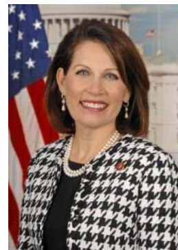
U.S. Rep. Michele Bachmann

The Light Bulb Freedom of Choice Act highlights growing concerns over the safety and environmental impact of compact fluorescent bulbs, or CFLs. Before the sale of incandescent bulbs is banned, the representatives are asking the comptroller general to prove replacement with CFLs will be cost-effective, reduce overall carbon dioxide emissions by 20 percent in the United States by 2025 and that the bulbs will not pose a health risk to the general public.