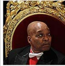
Leaders' Lavishness Gives Rise to 'Lifestyle Audits'