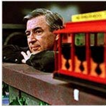
'Mister Rogers' Still Big in Pittsburgh