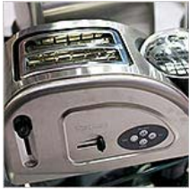
Taking the Fast-Food Mentality Into the Home