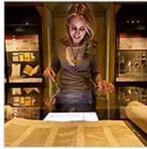
Where the Jewish Star Meets the Union Jack