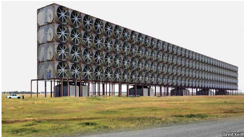
An airscrubber, from an artist's imagination

The chemically literate will spot a potential snag. Calcium oxide is made by heating up limestone (calcium carbonate). This drives off carbon dioxide. Generating the heat is also likely to involve the release of that gas. All this carbon dioxide will have to be squirrelled away in the same way carbon dioxide scrubbed from the air (or a power station’s chimney) would. But that might not be too hard. The gas will already be concentrated and pure if the kilns work the right way.