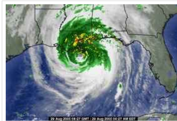
Satellite image of Hurricane Katrina in 2005

The patents describe a system that would place as many as 200 turbine engine barges in a path of a raging hurricane, and designed to then pump chilled water from its depth to the ocean's surface negating the hurricane's source of strength. The Vessels could be towed, dropped by planes or submerged in the ocean until needed.