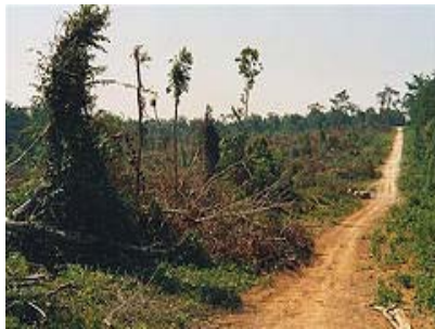
Laos: Forest cleared to make way for ADB-funded plantations.

According to the Bank, its plantations are “successful in reducing the overall rate of forest loss”. The reality is that forests are cleared to make way for ADB-funded plantations, for example in Laos, under the ADB’s “Industrial tree plantations project”.