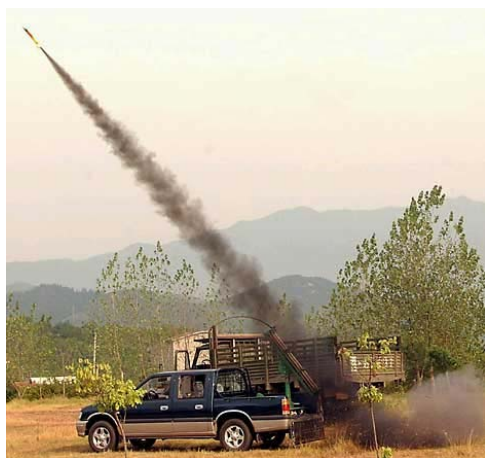
China weather rocket (2008 by ImpactLab)

2008 Chinese government used 1,104 cloud seeding missiles to remove the threat of rain ahead of the Olympic opening ceremony in Beijing. [37]