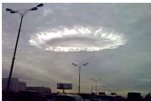
2009 Moscow Halo. Case Orange cites this as evidence of cloud seeding, but others suspect it is electromagnetic in origin. Russian authorities said it was an optical illusion. [38]

2008 Chinese government used 1,104 cloud seeding missiles to remove the threat of rain ahead of the Olympic opening ceremony in Beijing. [37]