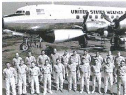
The crew in Operation Stormfury in 1963. Note the special belly on the Douglas DC6-B for cloud seeding purposes.

However, with widespread reporting of rising global temperatures, increasing population, and degradation of water supplies, renewed interest in EnMod is now becoming broadly supported. (See, e.g., Top economists recommend climate engineering, 4 Sep 2009 [11] and similarly, Top science body calls for geoengineering ‘plan B’, 1 Sep 2009.[12])