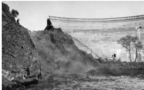
Charles Hatfield's rain washes out dam 1915, San Diego. Dozens died.

1915 To end a prolonged drought, San Diego hired reputed rainmaker Charles Hatfield, who claimed that the evaporation of his secret chemical brew atop wooden towers could attract clouds. San Diego was rewarded with a 17-day deluge that totaled 28 inches. The deadly downpour washed out more than 100 bridges, made roads impassable over a huge area, destroyed communications lines, and left thousands homeless. [27]