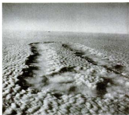
DRY-ICE SEEDING cut race-track patterns into clouds over Rome, N.Y. Dropping dry ice from plane was first successful way of making rain artificially.

1946 General Electric's Vincent Schaefer dropped six pounds of dry ice into a cold cloud over Greylock Peak in the Berkshires, causing an "explosive" growth of three miles in the cloud. [29]