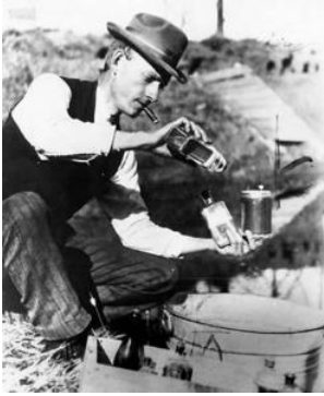
Rainmaker Charles Hatfield, in 1915, destroyed much of San Diego.

"In recent years there has been a decline in the support for weather modification research, and a tendency to move directly into operational projects." -World Meteorological Organization, 2007