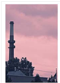
The Fisk Power Generating Station, an aging coal plant, is blamed for increased pollution hazards in Chicago's Pilsen neighborhood.

The natural gas is being developed through fracking , a combination of horizontal drilling and pressured shattering of deep shale formations to free gas and oil trapped within them.