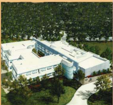
NARAC facility in Livermore, California.