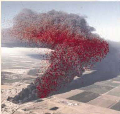
Smoke plume photograph with NARAC-simulated smoke particles in red.