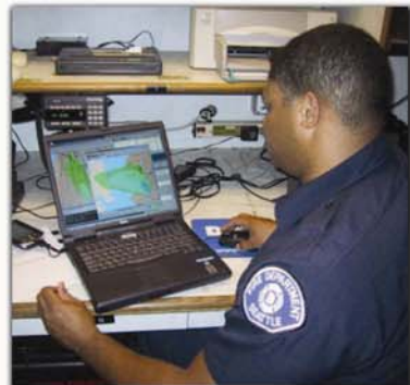
NARAC users access predictions in the field or in emergency operations centers using Web-based software.