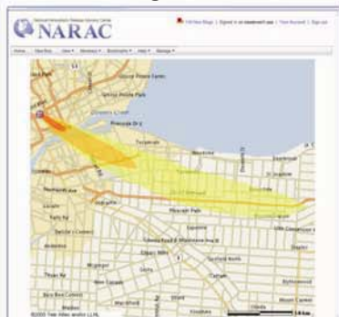
Plume predictions are accessed through NARAC Web software.