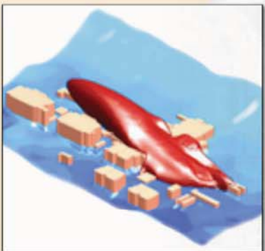
NARAC conducts research and development on atmospheric problems, such as dense gas dispersion around buildings and in complex terrain.