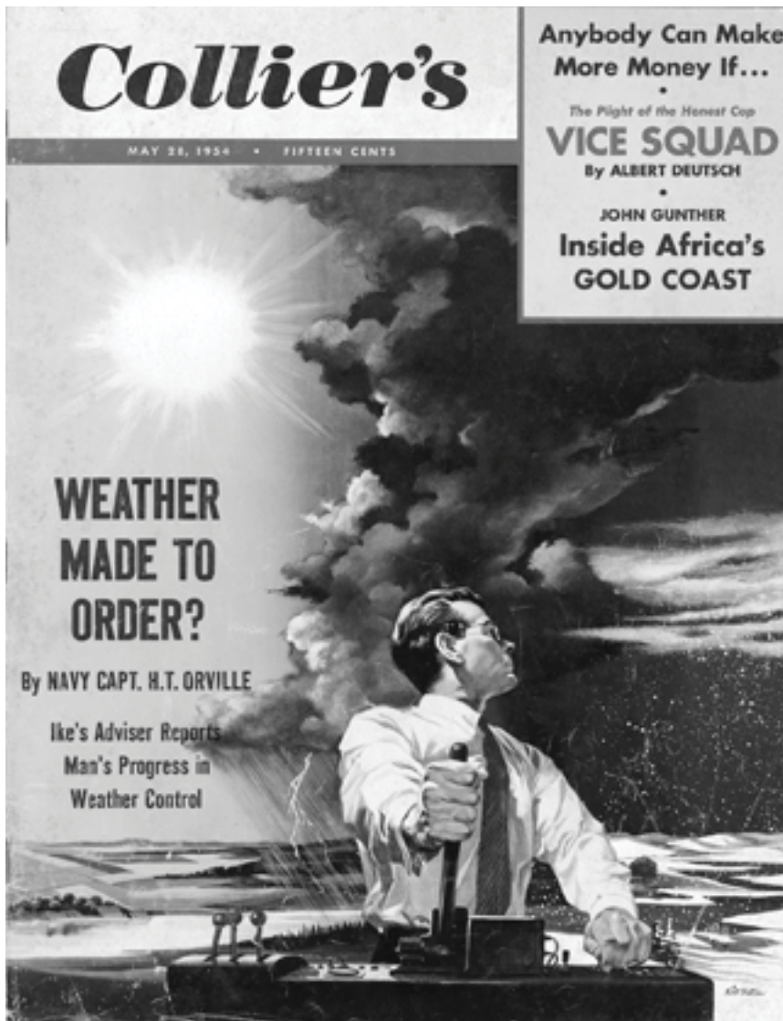
Experiments with cloud seeding during the Cold War inspired fantastic predictions about America's ability to control the weather, as in this 1954 article, and use it as a weapon against its communist adversaries.

“the science of things that aren’t so.” Yet there is hardly any scientific foundation for most claims about weather modification. Cloud seeding apparently can augment “orographic” precipitation (which falls on the windward side of mountains) by up to 10 percent. It is also possible to clear cold fogs and suppress frost with heaters in very small areas. That is the extent of what has been proved. Nevertheless, millions are still spent on cloud seeding today, largely by local water and power companies.