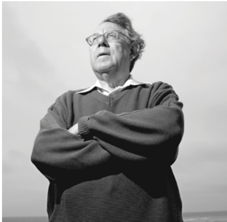
Nobel laureate Paul J. Crutzen favors a planetary “shade.”

As the sole historian at the NASA conference, I may have been alone in my appreciation of the irony that we were meeting on the site of an old U.S. Navy airfield literally in the shadow of the huge hangar that once housed the ill-starred Navy dirigible U.S.S. Macon . The 785-foot-long Macon , a technological wonder of its time, capable of cruising at 87