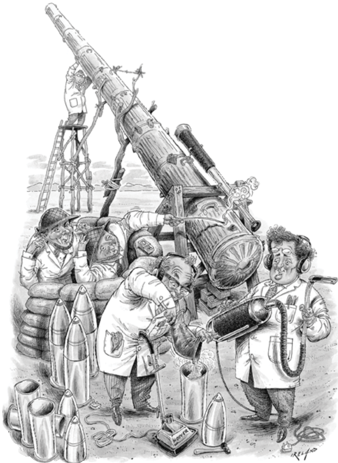
Ridicule greeted a 1992 proposal to combat global warming by shooting reflective particles into the atmosphere. The response could be different today.