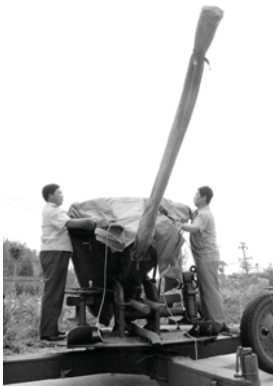
In China's active cloud-seeding efforts, anti-aircraft guns are used to shoot silver iodide crystals into the atmosphere. Beijing promises an intensive effort to clear the skies when the city hosts the Olympics in 2008.

In September 2001, the U.S. Climate Change Technology Program quietly held an invitational conference, “Response Options to Rapid or Severe Climate Change.” Sponsored by a White House that was officially skeptical about greenhouse warming, the meeting gave new status to the control fantasies of the climate engineers. According to one participant, “If