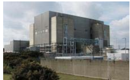
Sizewell nuclear power station in Suffolk

The Conservatives have expressed concern that the objections of local communities towards new nuclear plants could be ignored under the rules devised by the previous Government.