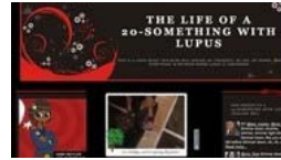
Lupus drug Benlysta offers long-awaited hope