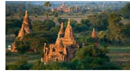
Myanmar's dazzling shrines to Buddha