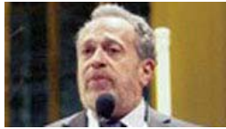
How I Made It: Economist Robert Reich