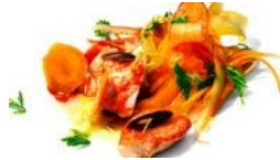
The Review: The Royce