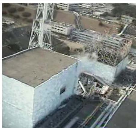
Reactors 2 (left) and 1 (right), April 10, 2011

Five weeks after the crisis at Japan's Fukushima Daiichi nuclear power station (FDI) first began, there is new evidence that the situation may have taken a turn for the worse.