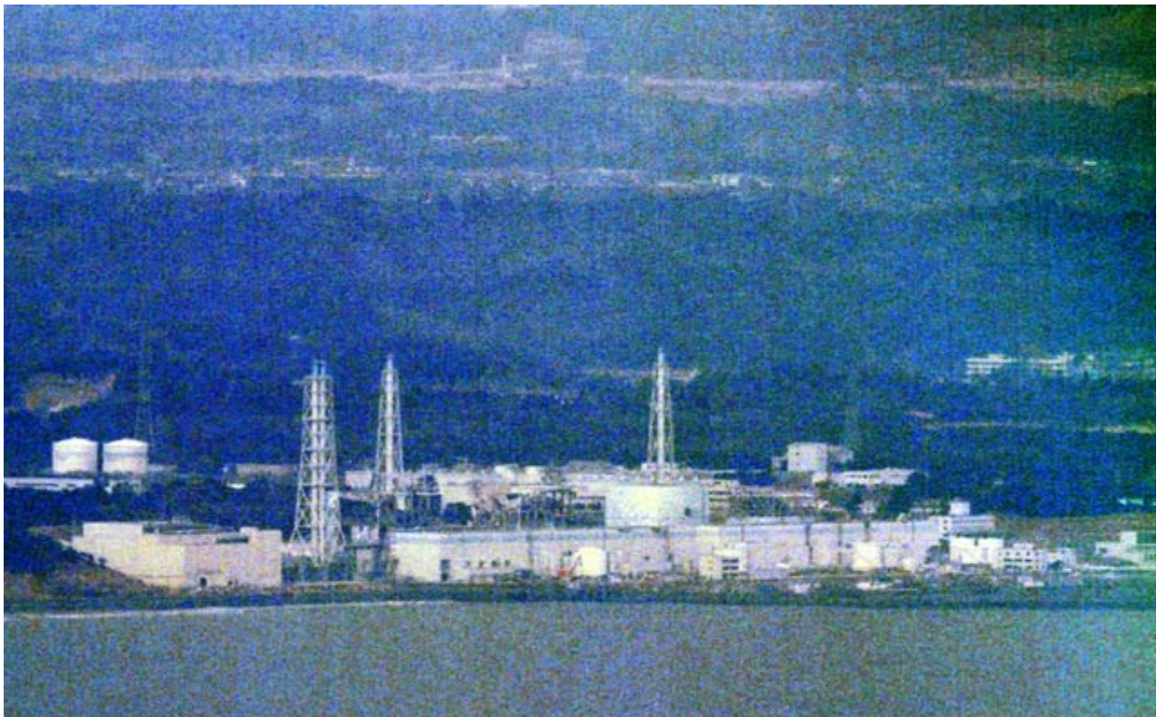
The Fukushima Dai-ichi nuclear power plant is seen in Okuma town in northeastern Japan on Thursday, April 7, 2011. After notching a rare victory by stopping highly radioactive water from flowing into the Pacific, workers at the flooded nuclear power complex turned to their next task Thursday: injecting nitrogen to prevent more hydrogen explosions. Nuclear officials said Wednesday there was no immediate threat of explosions like the three that rocked the Fukushima Dai-ichi plant not long after a massive tsunami hit on March 11, but their plans are a reminder of how much work remains to stabilize the complex.