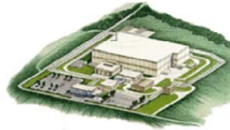
How the finished plant should look

The agreement covers the actual construction of the main plant and all its support facilities; cold start-up of the mixed-oxide (MOX) nuclear fuel plant; and support of the licensing process under the Nuclear Regulatory Commission. The plant is to be licensed to operate for 20 years.