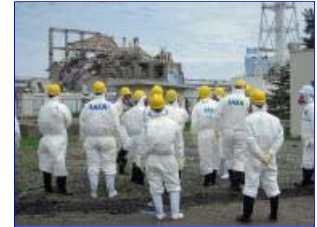
International Atomic Energy Agency inspection team members looking at the unit three reactor building of Fukushima