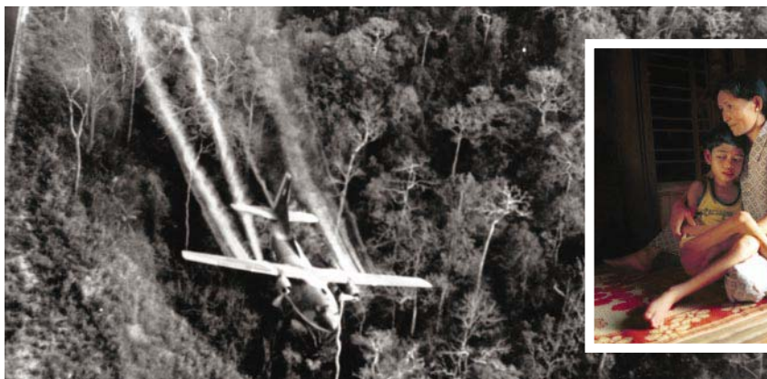
Up to 4 million Vietnamese may have been affected by American wartime defoliant spraying.

Like a widely cited 1974 National Academy of Sciences study on Agent Orange, the