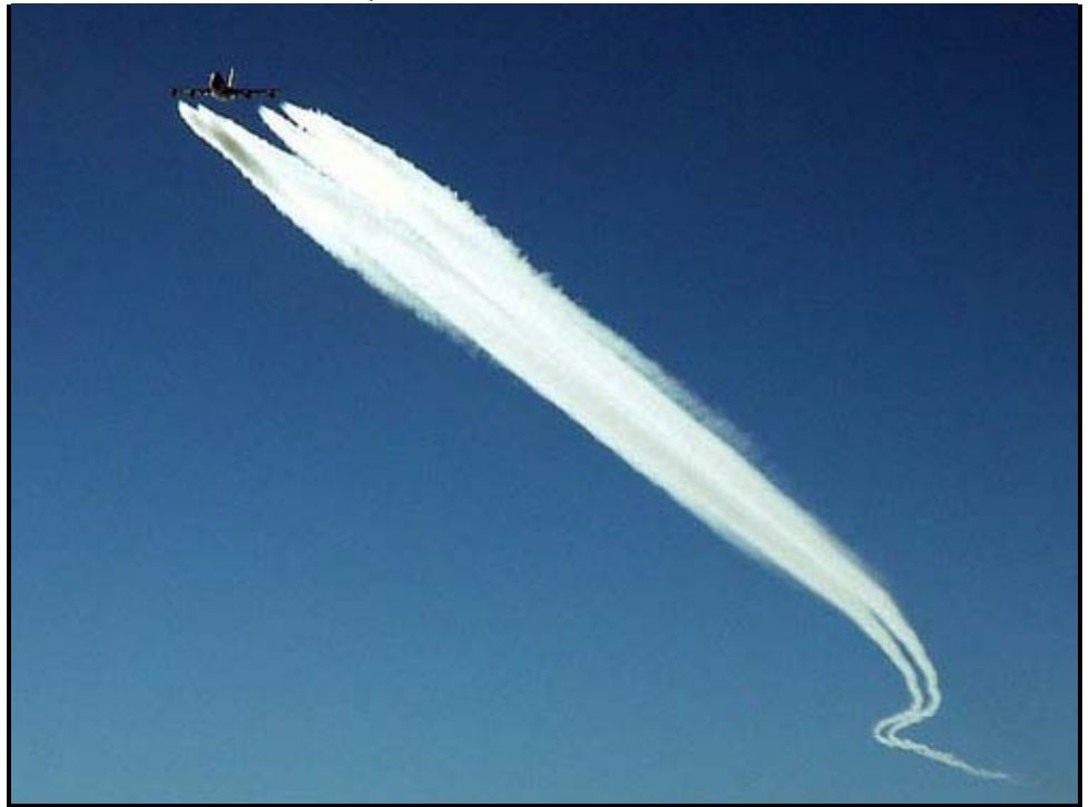
A 747 hard at work.