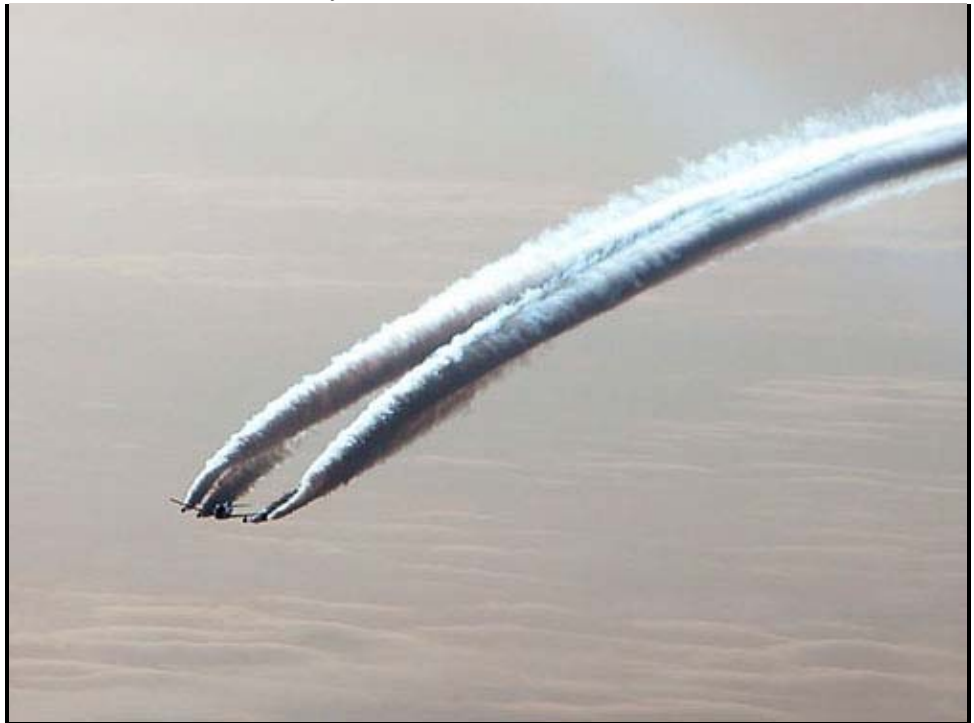
These trails are far beyond the usual hydrocarbon exhaust!