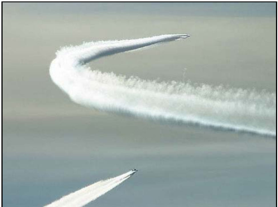
What can one say? Simply awe inspiring, and yet a little disturbing at the same time. Beautiful photography none the less. A Nikon D100 imaged these for you photo buffs.