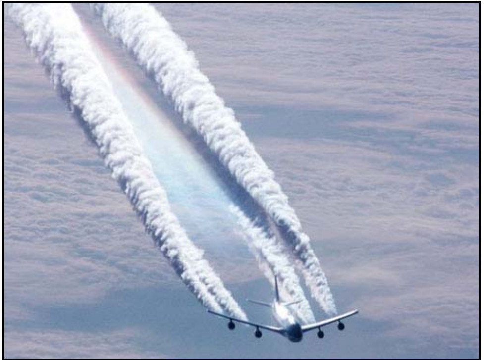
There is an unusual color evident in these trails.