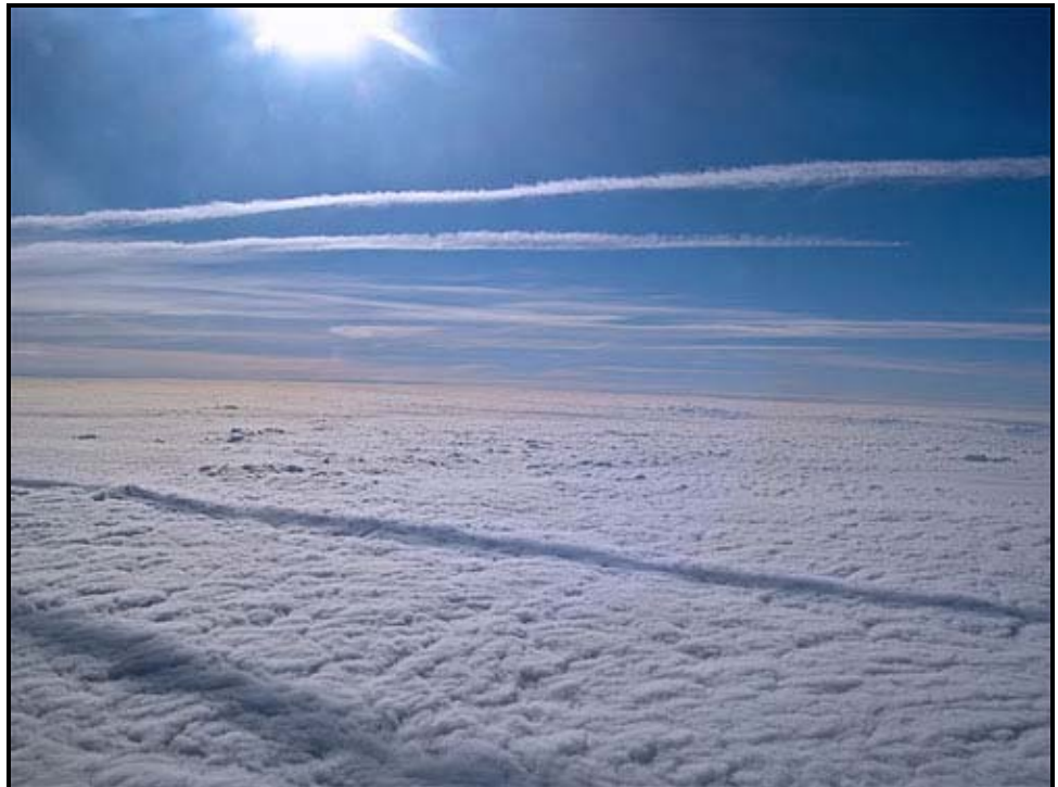
Now this is the view I'd like to have out my office window!