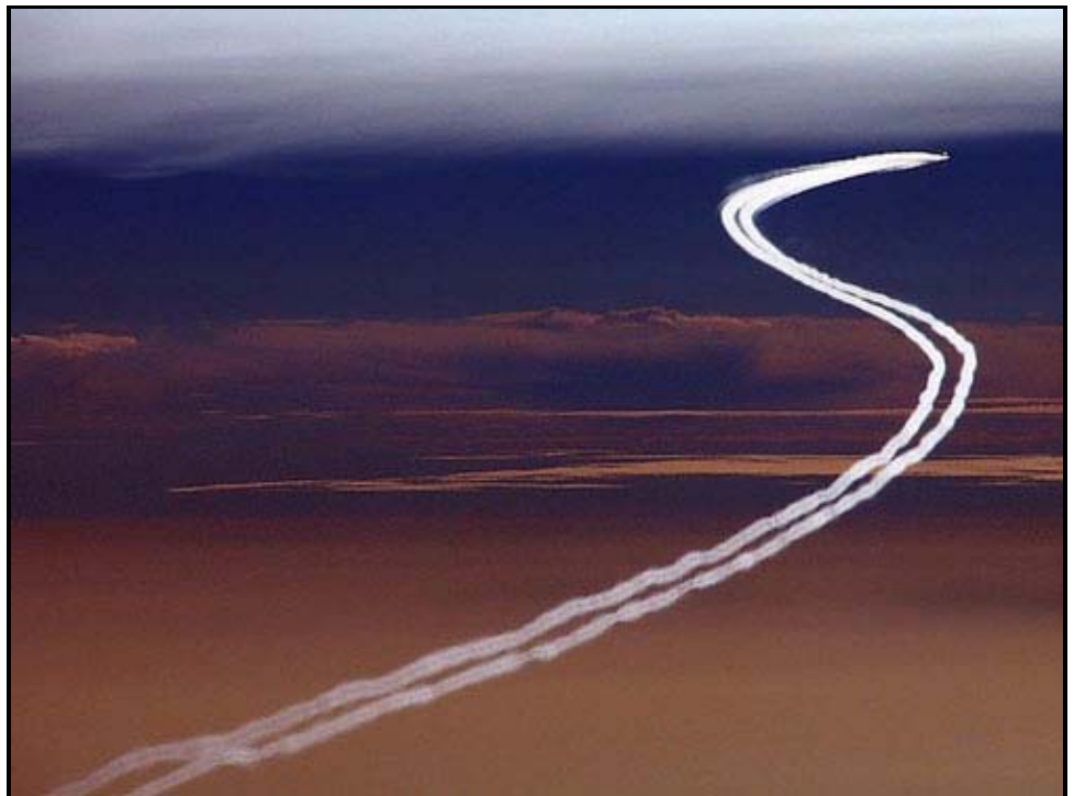
A little jog in the flight path while climbing in altitude. This is one of my favorites.