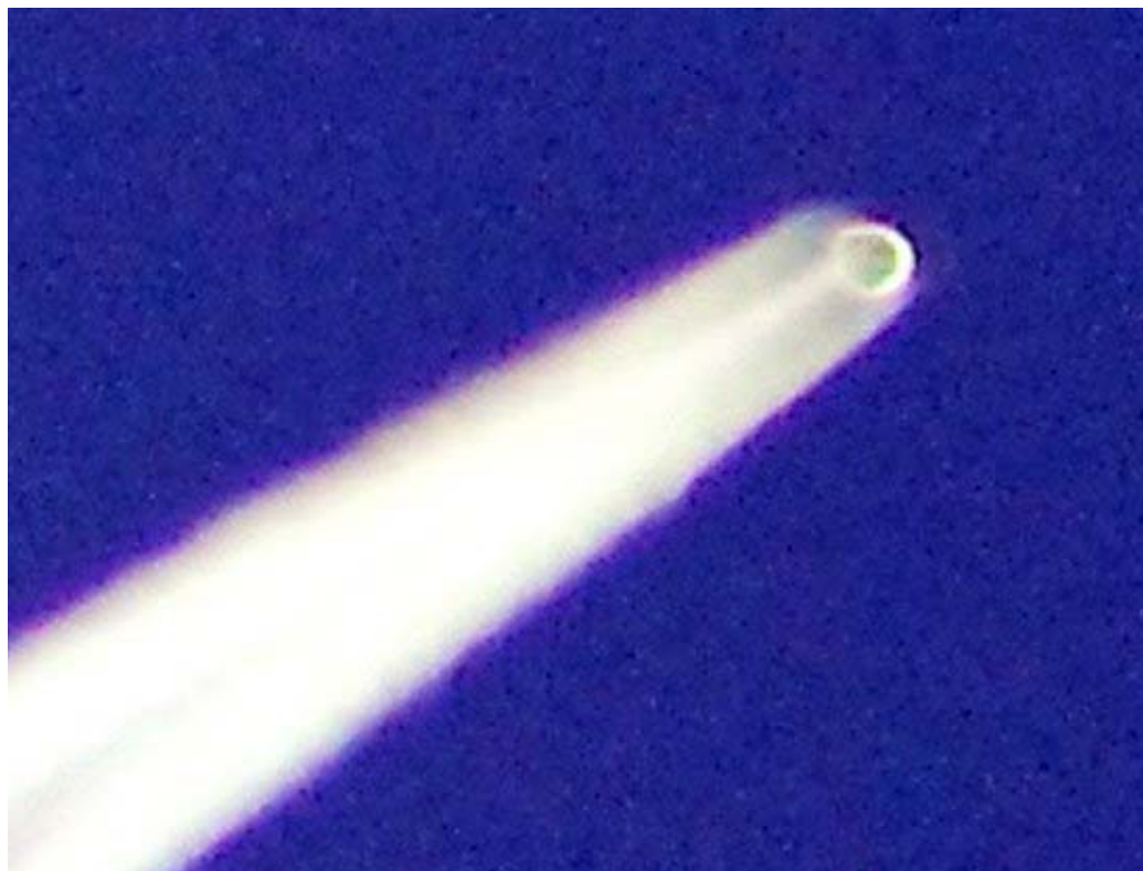
Magnified Section of Ring Like Structure in conjunction with "emissions" of an aerosol operation.