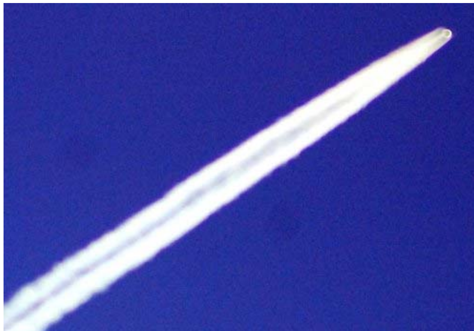
Above photo(1of2) reduced in scale to show greater perspective on "craft".