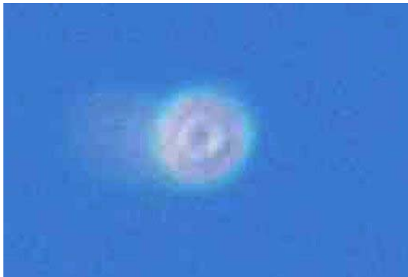
Second anomalous disk-ring like structure reported in combination with heavy aerosol operations. Separate geographic region and time from first set.