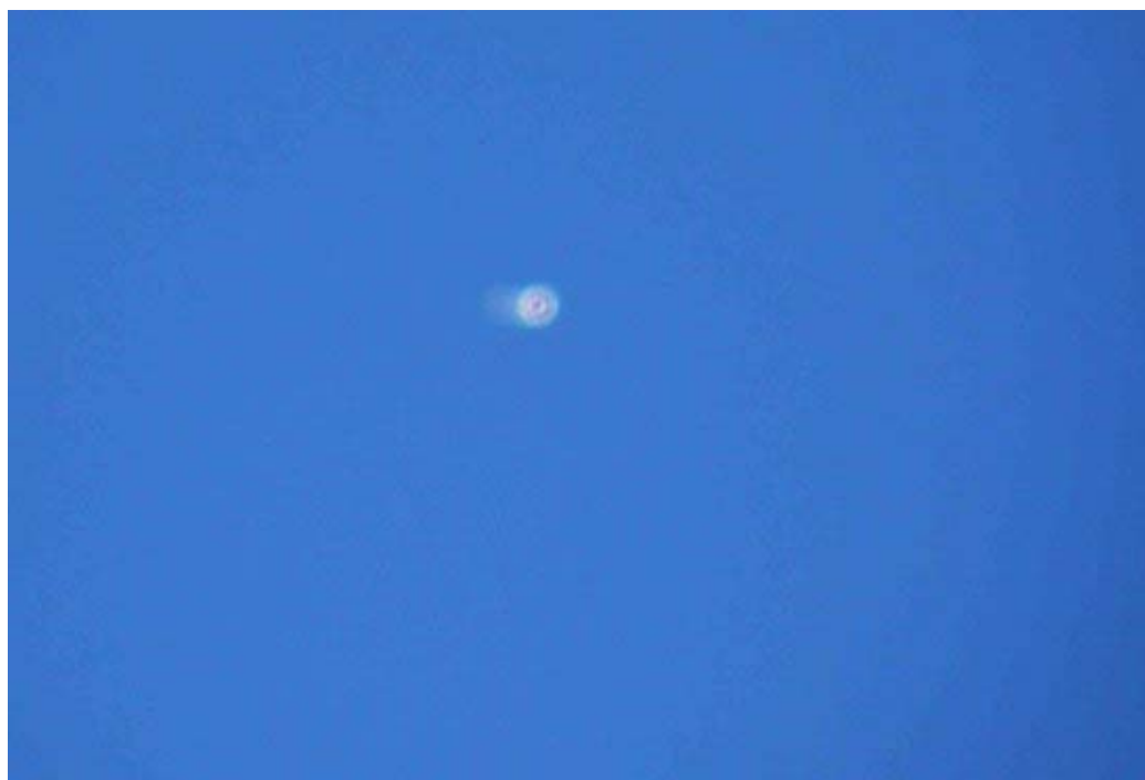
Reduced scale on second disk-ring like structure reported in association with heavy aerosol operations over area. Statement form photographer is to follow.