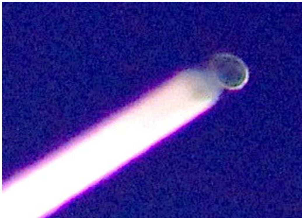
Second Image of Ring Like Structure (highly magnified) in conjunction with "emissions" of an aerosol operation.