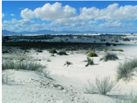
These are real clouds

Geo-engineering is defined as the large-scale manipulation of the earth's environment to suit human needs and "promote habitability." Once a controversial field, scientists around the world are now recruited and paid to develop methods of geo-interference to affect our climate and topography in the effort to mitigate the current "global warming crisis." Popular belief has it that our planet needs to be cooled because the CO 2 we have so carelessly created by burning fossil fuels is warming the planet and destroying the protective layer of ozone above us. We must deflect that hot sunlight away from us!