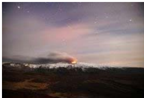
A volcano erupts near Eyjafjallajokull April 19, 2010. Flights from large parts of Europe are set to ...

By JOJI SAKURAI and KARL RITTER, Associated Press Writers - Wed Apr 21, 7:42 pm ET