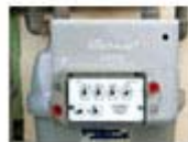
SmartMeter™ Gas Meter