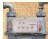
Traditional Gas Meter

Read all the dials, except the testing dials on a gas meter. (Testing dials have no numbers)