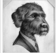
Op-Ed: My Life as Ted Kennedy's Dog

Home | World | U.S. | N.Y./Region | Business | Technology | Science | Health | Sports | Opinion | Arts | Style | Travel | Jobs | Real Estate | Autos | Back to Top © 2011 The New York Times Company | Privacy | Your Ad Choices | Terms of Service | Corrections | RSS | First Look | Help | Contact Us | Work for Us | Advertise | Site Map