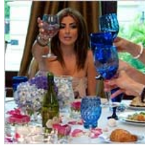
Another Battlefield in the War Against Wrinkles