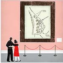
When the Doctor's Wife Has Cancer