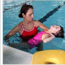
A School Topples Hurdles to Learning