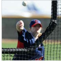
Straight Down the Middle, the Long Way