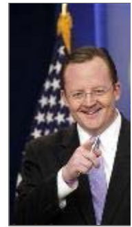
CAPTION

During his CNN appearance, Gibbs also talked about possible areas of cooperation between Obama and congressional Republicans, including the incoming GOP House majority. Possibilities include entitlement reform, education, and ways to reduce the massive federal debt.