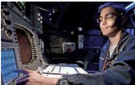
A Fire Controlman launches a Standard Missile-3 (SM-3)