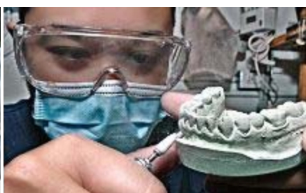
A Laboratory Technician shaves excess plaster away from a dental cast at the clinics dental lab.