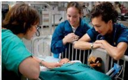
Navy Nurses comfort a small baby in the Intensive Care Unit aboard the Military Sealift Command hospital ship USNS Mercy