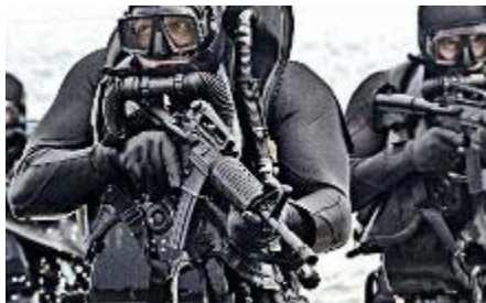
Navy SEALs practice evolutions during a training exercise.