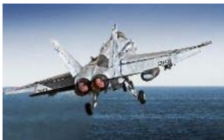
An F/A-18C Hornet launches from the deck of an aircraft carrier.