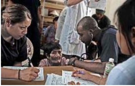
Sailors take vital signs during a medical civic assistance program.