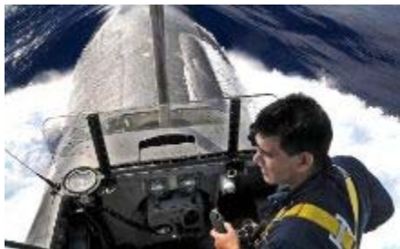
A damage control assistant aboard the Los Angeles-class attack submarine, uses a Global Positioning System to plot the ship's location while in transit.