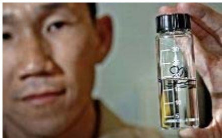
An Industrial Hygiene Officer prepares to test a water sample.