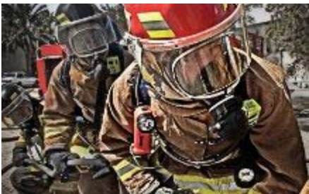
Fire team members support each other