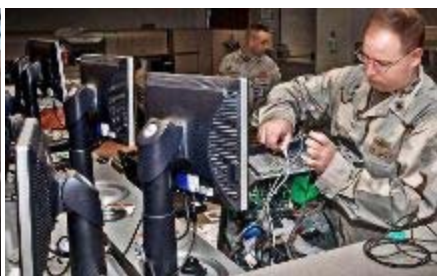
An Electronics Technician replaces a hard drive in a computer.