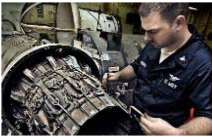
Aviation Structural Mechanic performs routine maintenance