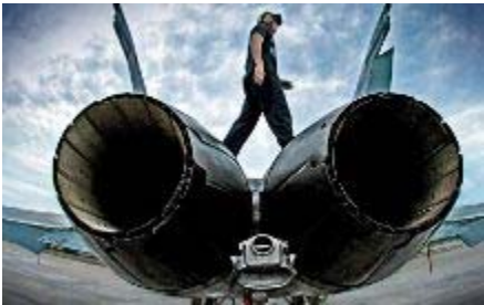
An airman performs a routine turnaround inspection on an F/A-18 Hornet