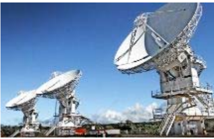
The Mobile User Objective System (MUOS)