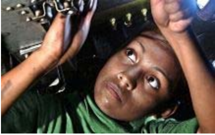
Aviation Structural Mechanic Airman