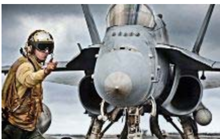
Atlantic Ocean Aviation Boatswain's Mate directs an F/A-18C Hornet across the flight deck of the Nimitz-Class aircraft carrier USS Harry S. Truman