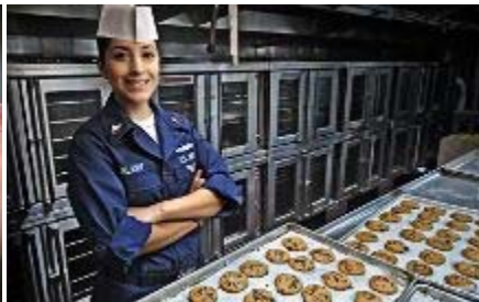
Culinary specialists are responsible for feeding the crew