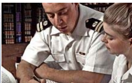
Navy JAG Officers discuss an upcoming trial.