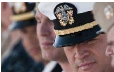
Navy Officers marching in formation