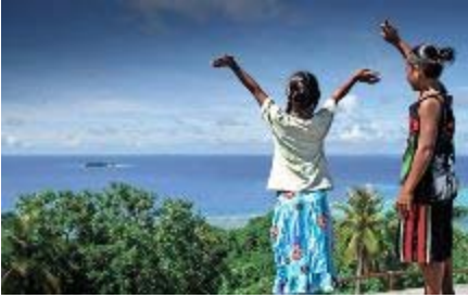
Children wave at a passing MH-60S Sea Hawk helicopter