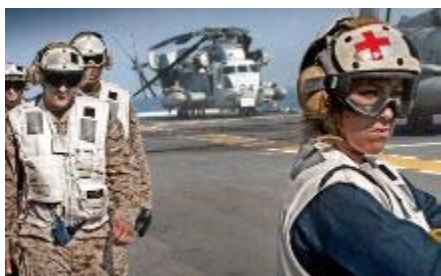
Chief Hospital Corpsman surveys the scene during a damage control drill