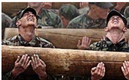
Basic Underwater Demolition/SEAL (BUD/S) students participate in Log PT (physical training)