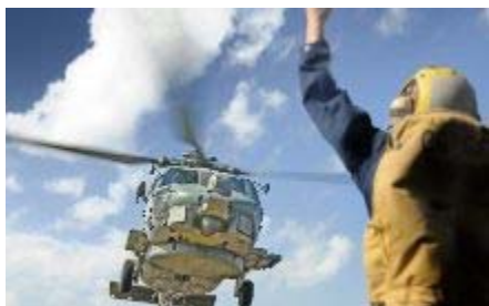
Boatswain's Mate directs an SH-60 Seahawk helicopter