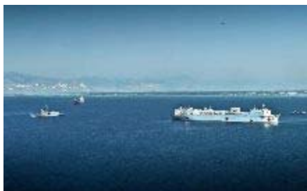
The Military Sealift Command hospital ship USNS Comfort