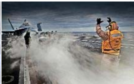
Chief Aviation Boatswain's Mate directs an F/A-18C Hornet onto catapult