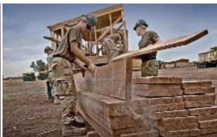
A Steelworker Constructionman