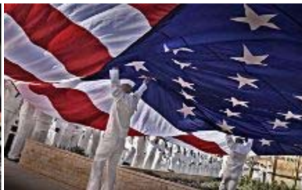
Sailors open an American flag before a Memorial Day event.