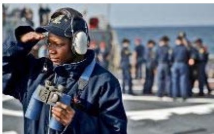
Boatswain's Mate looks out over the ocean during her watch aboard the guided-missile destroyer USS Porter while underway to Fleet Week in Port Everglades, Florida