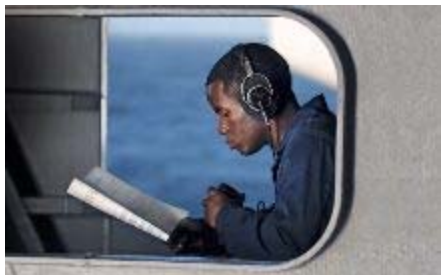
A Yeoman Seaman studies advanced qualifications while standing by.