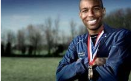
The all-Navy men's team