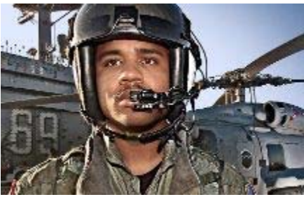
A Navy pilot prepares for flight operations