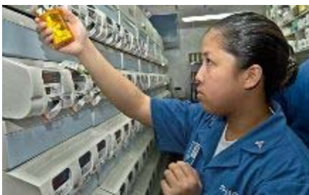
A Hospital Corpsman uses an automatic pill dispenser to refill a patient's prescription