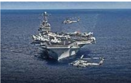
Two HH-60H Seahawk helicopters hover in front of an aircraft carrier