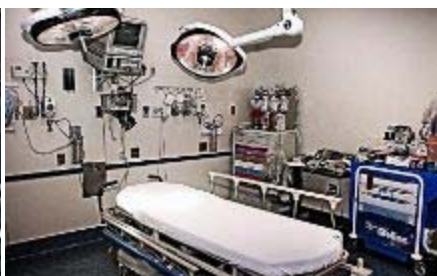
A state-of-the-art emergency room at one of the Naval Medical Centers.