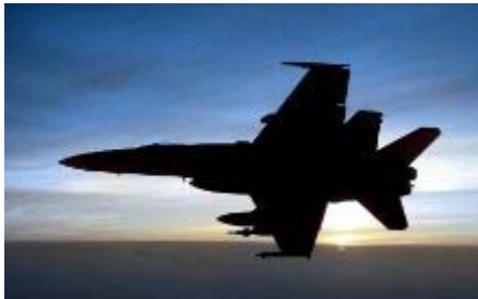
An F/A-18C Hornet