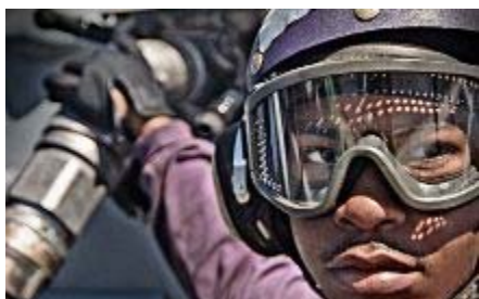
An Aviation Boatswain's Mate refuels an aircraft