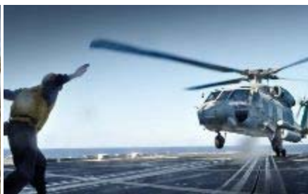
A Boatswain's Mate guides an SH-60H Sea Hawk helicopter to land aboard a guided-missile cruiser.