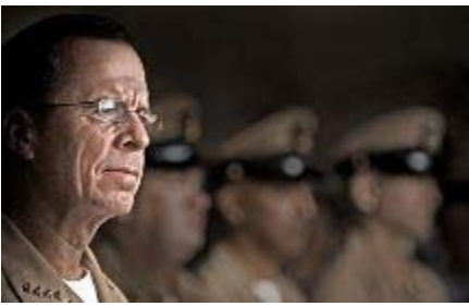
Chief of Naval Operations attends a frocking ceremony