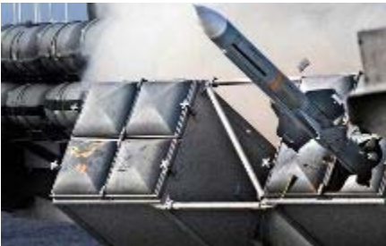
Sea Sparrow missile