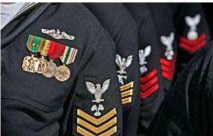
The many rates that make up a crew stand at attention