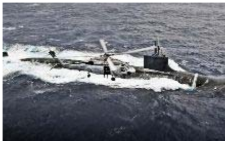
A SH-60F Sea Hawk helicopter flies over a Sea Wolf class submarine during a 26 ship formation photo exercise.