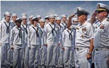
Commanding officer and Command Master Chief salute the troops.