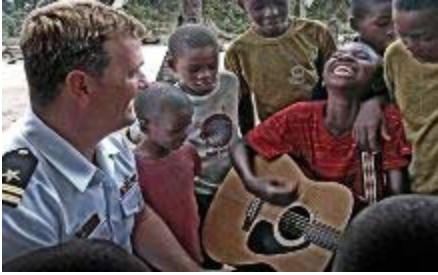
Assistant director of the U.S. Navy Europe-Africa Band