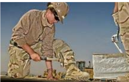
A Navy Construction Battalion Builder builds decking for a Southwest Asia Hut