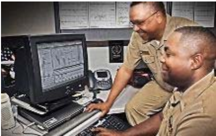
The diversity director