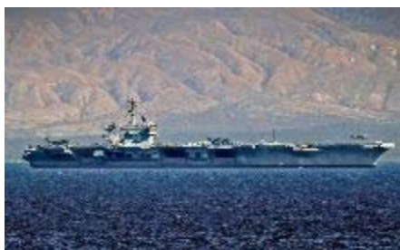
The aircraft carrier is a part of a group of ships providing military support