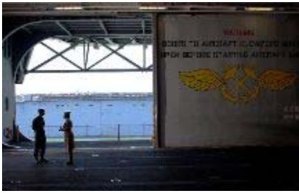
Chaplain in Hangar Bay