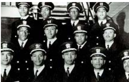
The "Golden Thirteen."