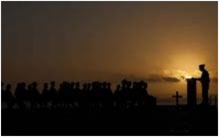
Chaplain service on flight deck