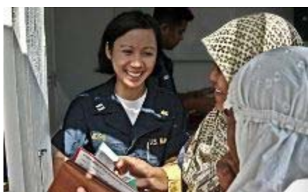
Navy Lieutenant talks with local residents about a prescription at a medical and dental civil action project at a health clinic.