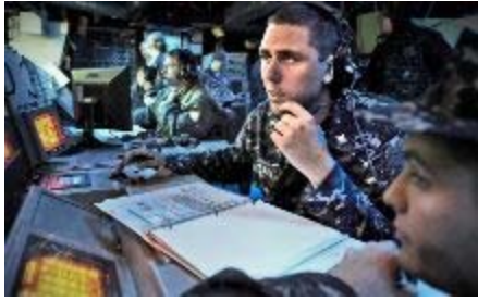
An Operations Specialist aboard the amphibious dock landing ship.