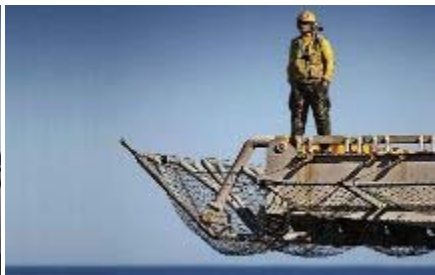
An aircraft director watches from a flight deck elevator as a multi-purpose amphibious assault ship conducts a replenishment at sea.