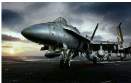
An F/A-18C Hornet sits on the flight deck of an aircraft carrier as the sun sets.