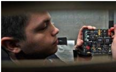
An Electronics Technician