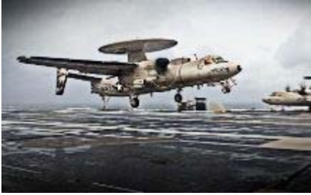
An E-2C Hawkeye