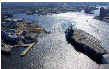
A Nimitz-class aircraft carrier transits up the Elizabeth River