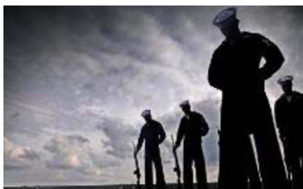
Sailors bow their heads in prayer during a ceremony aboard a Nimitz-class aircraft carrier.