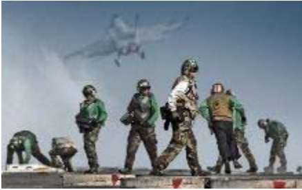
Flight deck personnel prepare to launch the next aircraft