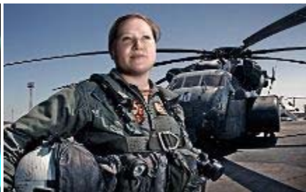
A helicopter pilot stands in front of an MH-53E Sea Dragon helicopter.