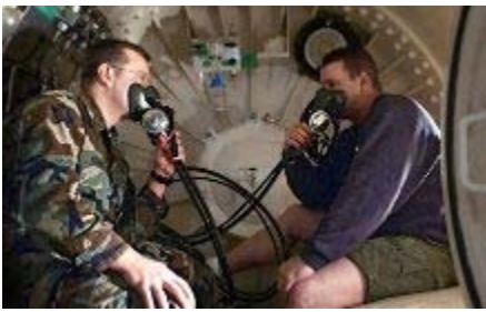
Navy Divers test built-in breathing masks inside a recompression chamber