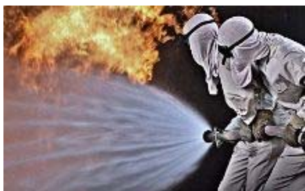
Navy Midshipmen train on proper firefighting techniques.