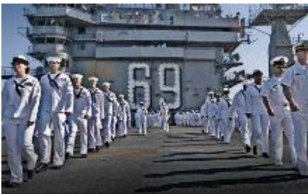
Sailors man the rails during the homecoming of a Nimitz-class aircraft carrier.