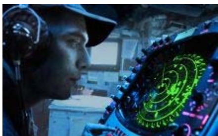
Mineman Seaman Recruit works at the radar station