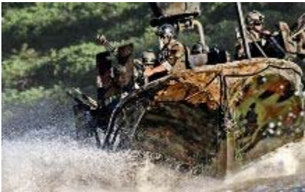
Special Warfare Crewmen conduct live-fire immediate action drills.