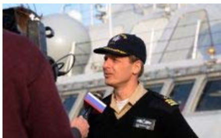
An operational Commander addresses the media after being briefed and advised by his Public Affairs Officer.