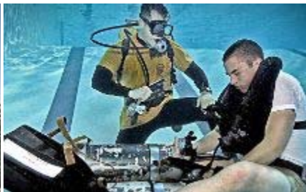
Naval Diving and Salvage Training Center instructor