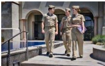
A top college, doing what you do best. Playing hard. Studying harder.