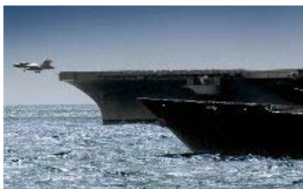
An F/A-18 Hornet launches from an aircraft carrier.