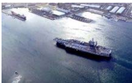
An aircraft carrier passes by the Arizona Memorial as Sailors spell FREEDOM.