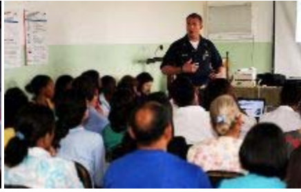
An environmental health officer teaches proper water sanitation procedures.