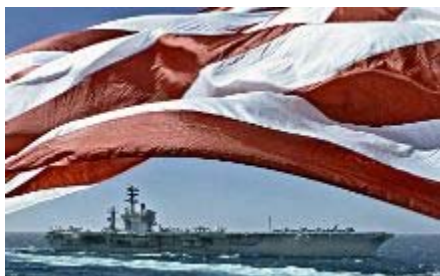
An aircraft carrier steams along as the American Flag waves proudly in the wind.