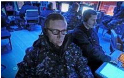
Air Traffic Controllers track an inbound helicopter from the ship's air traffic control center.