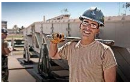
Construction Electrician attaches a section of a medium girder bridge during a training exercise.