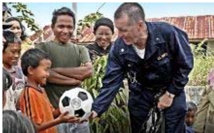
Navy Chaplain awards a boy a soccer ball