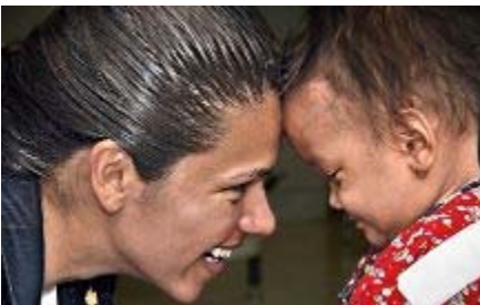
A physical therapist plays with a young girl