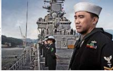
Sailors man the rails