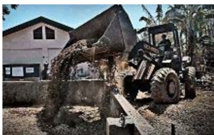
A front loader pours earth to be used in the building of a foundation