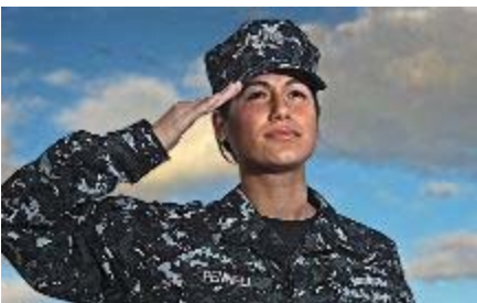
Navy Recruiting Command produces a TV commercial