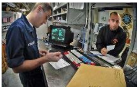
Postal Clerk Seaman Apprentice assists Chief Sonar Technician with mail in the post office aboard an aircraft carrier.