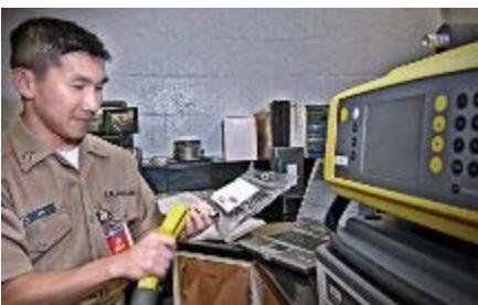
An industrial hygiene officer tests an air sample for contaminants