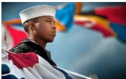
Operations Specialist Seaman mans the rails aboard an Arleigh Burke-class guided-missile destroyer during the ship's commissioning ceremony.