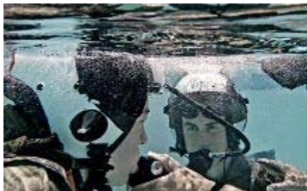
Two Naval students submerge and breathe from SCUBA tanks