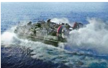
A landing craft air cushion (LCAC) exits the well deck of a multi-purpose amphibious assault ship