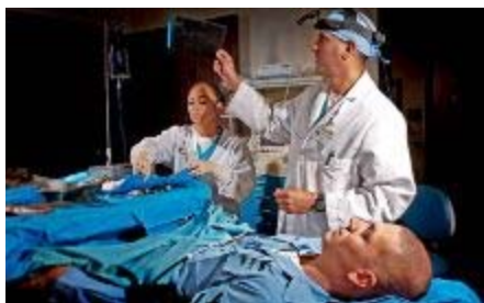
Navy performs a routine examination in one of the ship's dental examination rooms on a Military Sealift Command hospital ship USNS Mercy