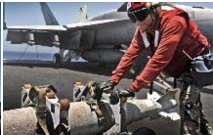
Aviation Ordnanceman on the flight deck