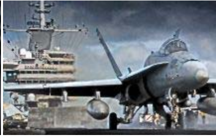
An F/A-18C Hornet launches from an aircraft carrier