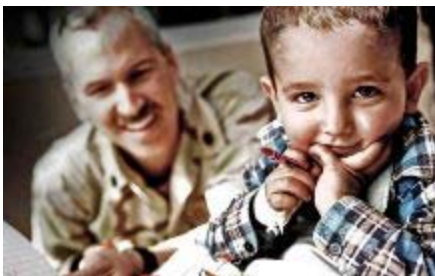
A Social Worker colors with an Afghan boy in the Indira Gandhi Children's Hospital Burn Ward.