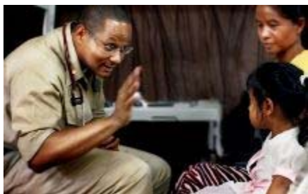
Navy speaks with 3-year-old girl and her mother at Charity Hospital in Latin America