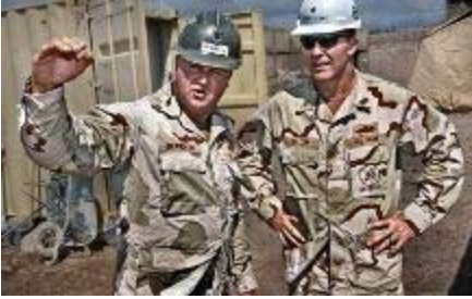
U.S. Naval Facilities Engineering Command Rear Admiral speaks with a Construction Electrician