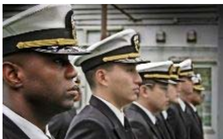
A personnel inspection coinciding with a change to winter uniforms.