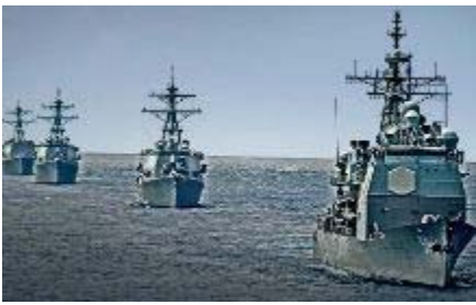
A guided-missile cruiser and guided-missile destroyers