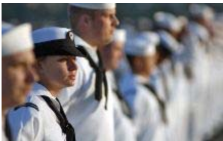
Sailors man the rails as Nimitz-class aircraft carrier USS Abraham Lincoln pulls into her homeport at Naval Station Everett