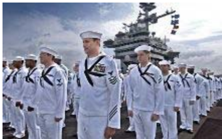
Sailors prepare to man the rails on the flight deck aboard an aircraft carrier.