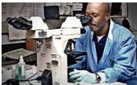
A Navy Hospital Corpsman checks a specimen in the "stat lab".