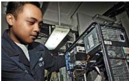
Information Systems Technician