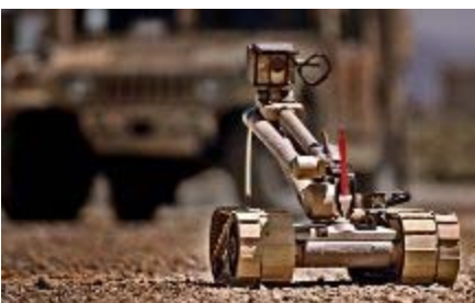
Members of the Navy's Explosive Ordnance Disposal (EOD) conduct training evolutions with the Pac Bot remote-controlled vehicle.