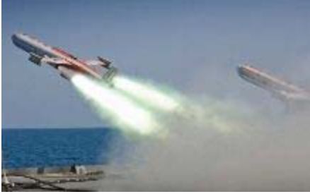
A drone is launched from an amphibious dock landing ship