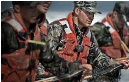
Basic Underwater Demolition/SEAL (BUD/S) students