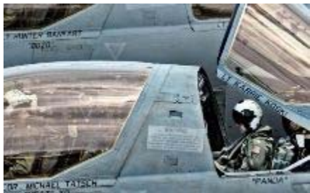
EA-6B Prowler aircrew commence start-up procedures on the flight deck aboard an aircraft carrier.