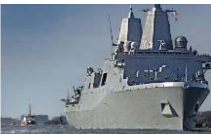
The amphibious transport dock ship Pre-Commissioning Unit (PCU) New York