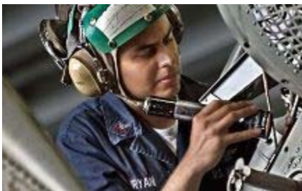
Aviation Structural Mechanic