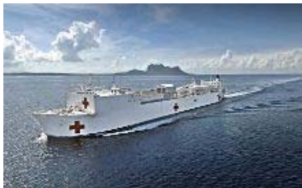
Mercy is uniquely capable of supporting medical and humanitarian assistance needs