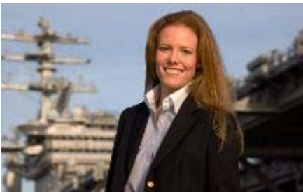
Navy experience is something that always looks good on a resume.