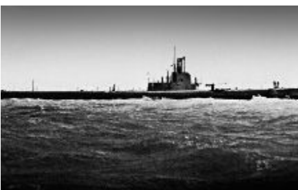
USS Wahoo (SS 238) gets underway for her seventh war patrol