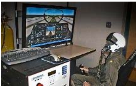
A Sailor sits in a simulator during a test flight using the new Reduced Oxygen Breathing Device (ROBD).