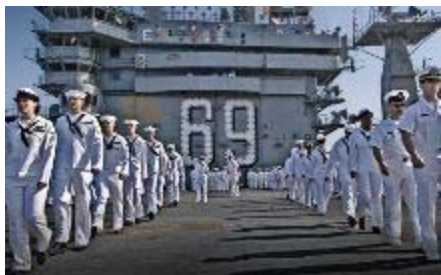
Sailors man the rails during the homecoming of the Nimitz-class aircraft carrier USS Dwight D. Eisenhower