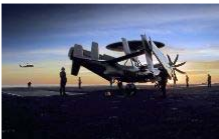
Flight deck personnel prepare for night operations aboard an aircraft carrier.