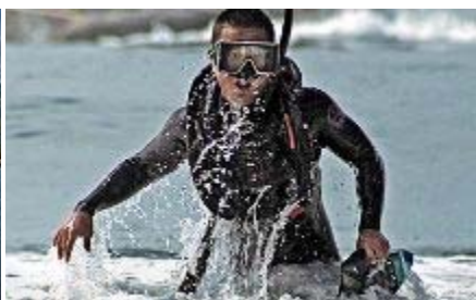
Aviation Aircrewman completes a swim relay during the Annual Aircrew competition.