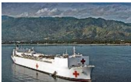
The hospital ship USNS Mercy deployed to a region to provide humanitarian assistance