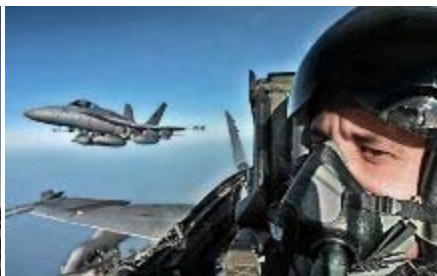
A pilot in an F/A-18 Hornet conducting combat operations.