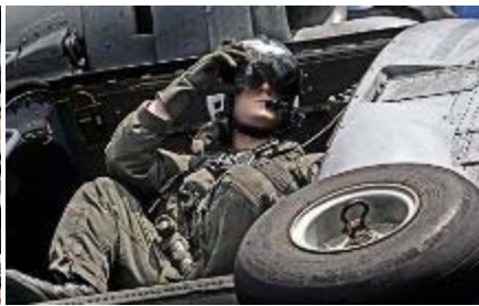
Naval Aircrewman looks out the door of an SH-60F Sea Hawk