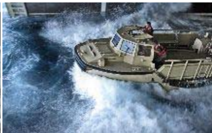
A Construction Mechanic drives a light amphibious re-supply cargo vehicle through the well deck of an amphibious assault ship.