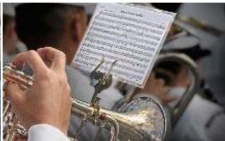
Navy musicians march in a Veteran's Day parade.