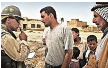
A Navy Utilitiesman talks to a community elder through an interpreter during a community relations project.