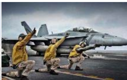
Three Catapult Officers simultaneously launch an F/A-18F Super Hornet from the deck of an aircraft carrier.