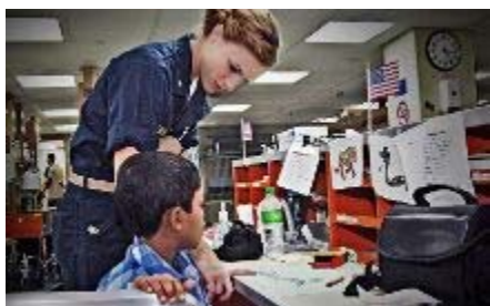
Navy Lieutenant compliments a young boy on a drawing