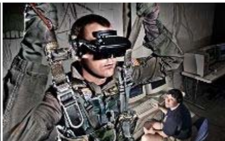
A Hospital Corpsman demonstrates the Virtual Reality (VR) parachute trainer