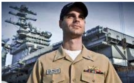
Surface Warfare Officer serving on board the USS Nimitz