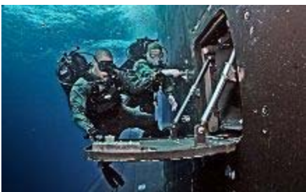
Navy divers and special operators conduct Training