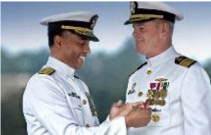
A Rear Admiral presents the Meritorious Service Medal.