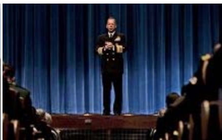
The Admiral of the Joint Chiefs of Staff addresses students and faculty at the Naval War College in Newport, R.I.