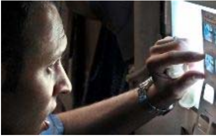
A dental officer reviews dental X-rays