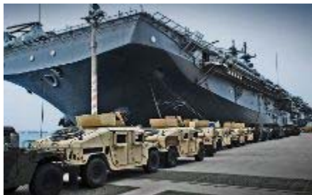
The forward deployed amphibious assault ship is pier side at White Beach Naval Facility.