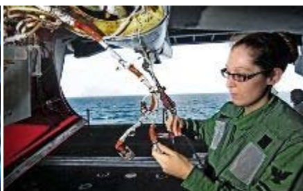
Aviation Electronics Technician spot ties wiring on an EA-6B Prowler