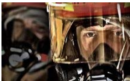
Crew members take part in a series of damage control training scenarios