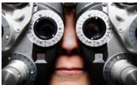
A Commander is fitted to a phoropter during an eyeglass prescription examination.