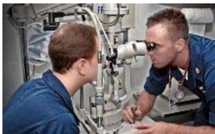
Chief Hospital Corpsman performs an eye exam on a patient aboard an aircraft carrier.