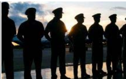
Navy Officers line the door of a hangar at Naval Air Station Joint Reserve Base, New Orleans