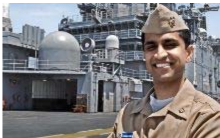
Lawyer in the Navy Judge Advocate General's (JAG) Corps