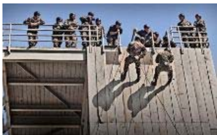
Sailors practice rappelling skills during exercises.