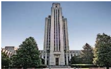
Entrance to the administration building at the National Naval Medical Center in Bethesda, Md.