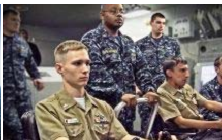
Sailors assigned to a guided-missile submarine practice skills controlling the boat in the Ships Control Team Trainer.