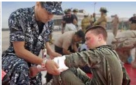
A Hospital Corpsman bandages a Naval Aircrewman during an emergency drill.