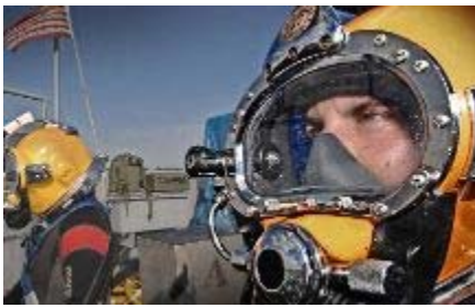
Mass Communication Specialist prepares to dive