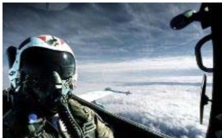
Naval Aviator in the cockpit