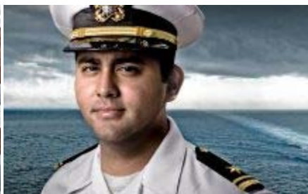
BDCP – One path to a future as a Navy Officer