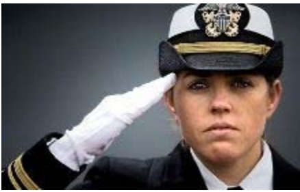
Ship's Navigator renders honors to the national anthem