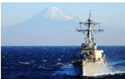
The guided-missile destroyer USS Curtis Wilbur.