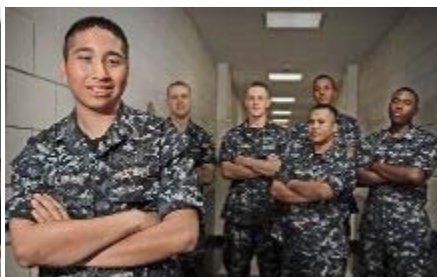
Upon completion of "Boot Camp" these sailors are taught the basics of teamwork and attention to detail