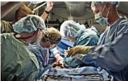
U.S. Navy Surgeons and Hospital Corpsman operate on an injured person.