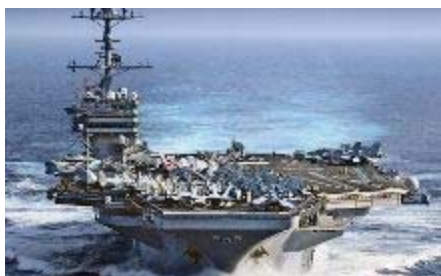
An aircraft carrier is participating in Annual Exercise (ANNUALEX 21G), a yearly bilateral exercise.