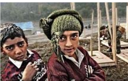
The Seabees, Navy Construction Battalion