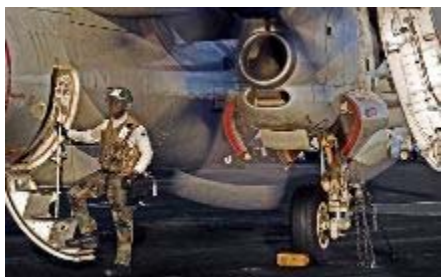
An Aviation Structural Mechanic prepares an E-2C Hawkeye for launch aboard an aircraft carrier.