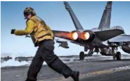
Aviation Airman runs to position another aircraft