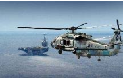
Two HH-60H Sea Hawk helicopters armed with AGM-114 Hellfire missiles