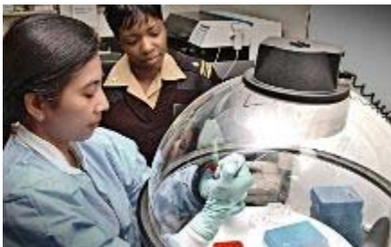
An Officer oversees a test conducted by a civilian technician.