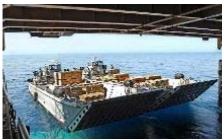
Landing craft mechanized boats depart an amphibious dock landing ship with relief supplies.