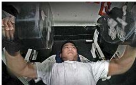
Personnel Specialist performs a butterfly dumbbell press