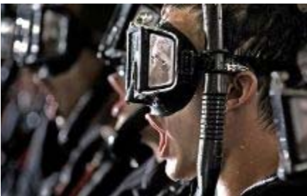
Navy Divers in training