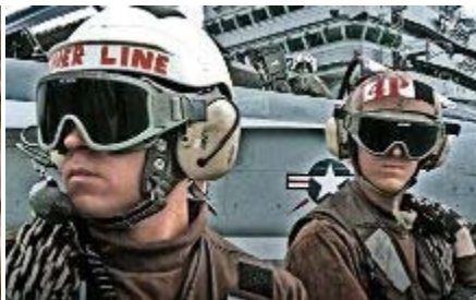
Aviation Structural Mechanic and an Airman observe flight operations on the flight deck aboard an aircraft carrier.