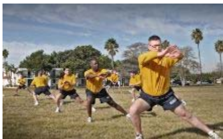
Sailors stretch before group physical training.