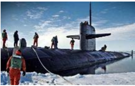
A fast attack submarine is moored at the North Pole