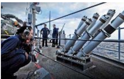
Cryptologic Technician (Technical) establishes communications with the combat information center