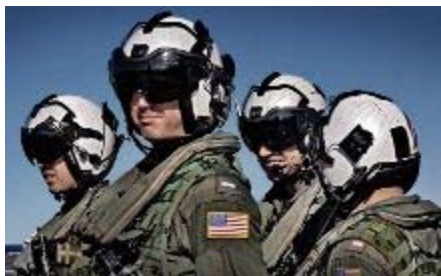
Aircrewman prepare to board an HH-60H special warfare helicopter from the flight deck.