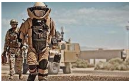
Members of the Navy's Explosive Ordnance Disposal (EOD) conduct training evolutions.