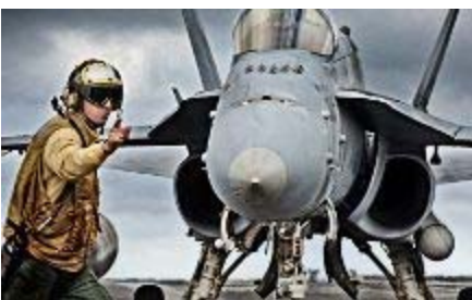
An Aviation Boatswain's Mate directs an F/A-18C Hornet across the flight deck of an aircraft carrier.