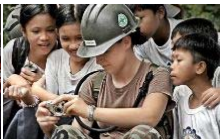
Builder Constructionman Apprentice shows some Filipino children the photo she just took of them.