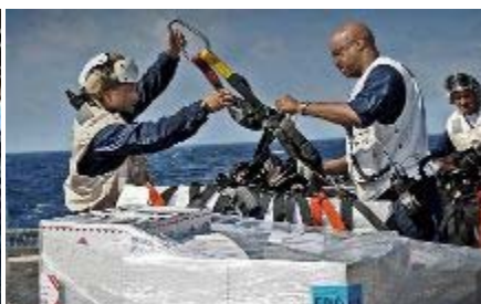
Command Master Chief and Chief Aviation Structural Mechanic unpack supply pallets during a vertical replenishment at sea aboard the Arleigh Burke-class guided-missile destroyer.