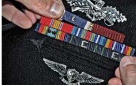
A Battle "E" ribbon