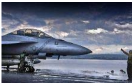
F/A-18F Super Hornet