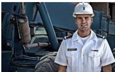
A Civil Engineer on a construction site.