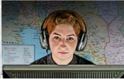
A Sailor uses the new self-paced foreign language training software.