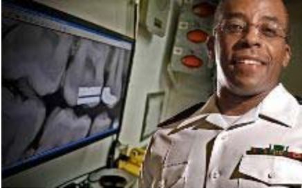
General Dentistry Officer looks over X-rays