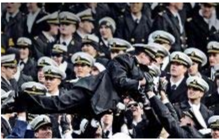
Army-Navy college football game