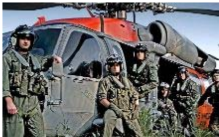
Navy Aviation Rescue Swimmers (AIRR) and Aircrew