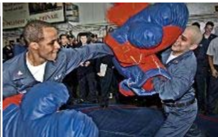
Two Sailors swing at each other in a boxing match on the ship's flight deck