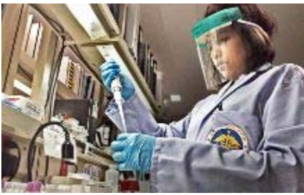
A Hospital Corpsman