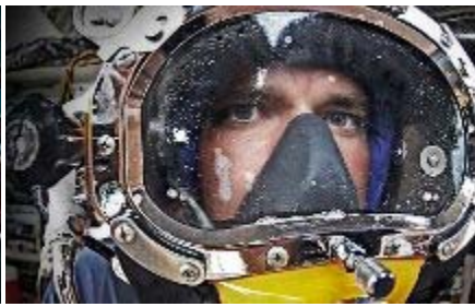
Diving medical officer prepares to dive