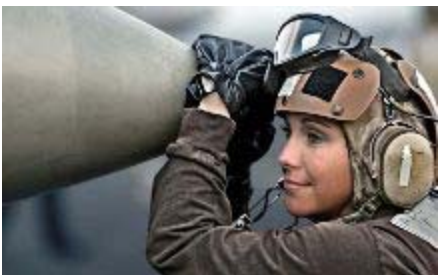
Chief Aviation Machinist's Mate waits near an F/A-18C Hornet