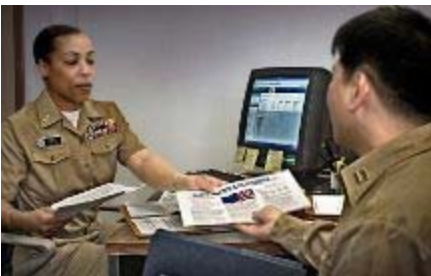
A Volunteer Income Tax Assistant (VITA) assists the Lieutenant with his yearly taxes.