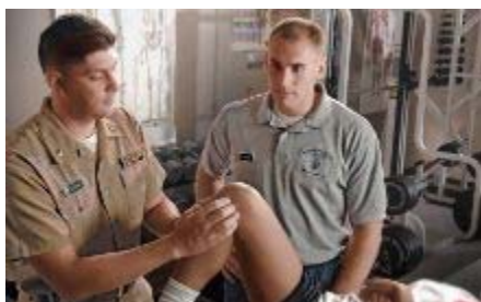
An Occupational Therapist administers therapy to a Sailors knee.