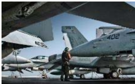
A plane captain cleans an F/A-18C Hornet aboard an aircraft carrier.