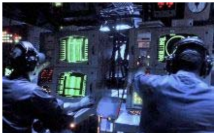
Sonar Technicians monitor sonar equipment