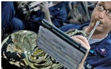
A Navy Musician takes direction from the conductor