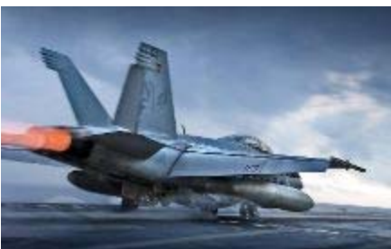
An F/A-18F Super Hornet launches off the deck of an aircraft carrier.