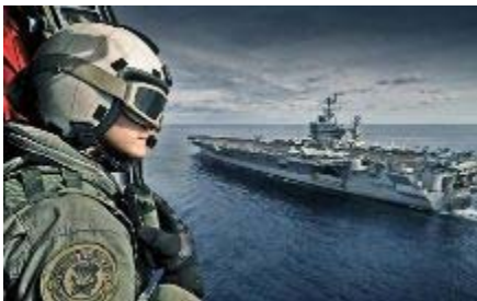
A Naval Air Crewman conducts a visual patrol out of an SH-60F Sea Hawk helicopter