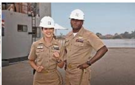
Officers in the Navy Civil Engineer Corps (CEC)