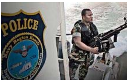
Master-at-Arms Seaman mans an M-60 machine gun