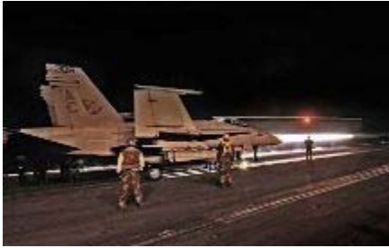
An F/A-18 Hornet prepares to catapult off the flight deck