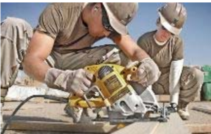
Two Construction Electricians cut bracing