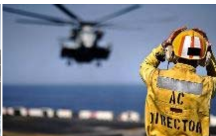
An aircraft director guides an MH-53E Sea Dragon to a landing spot aboard an amphibious assault ship.