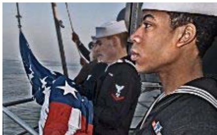
Sailors prepare to raise the American Flag during morning colors.