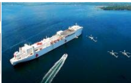
MH-60S Seahawks return to the Military Sealift Command hospital ship USNS Mercy