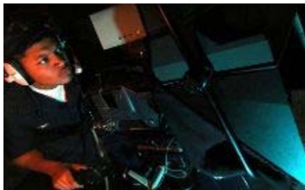
A Mass Communication Specialist prepares video equipment.