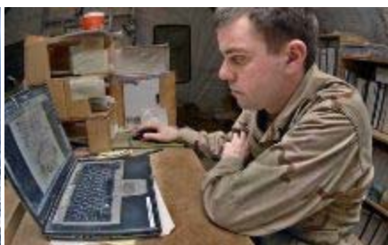
Navy research psychologists test theories everywhere from world-class laboratories to remote field settings.