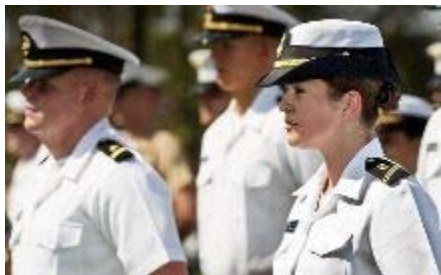
NROTC San Diego Conducts Pass-in-Review and awards.