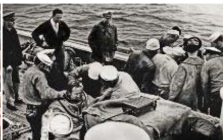
Crewmen suit-up two Deep Sea Divers during the rescue/salvage operation