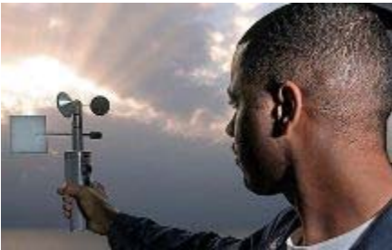
Aerographer's Mate tests the winds