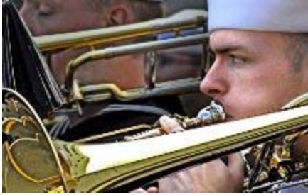
A Navy Musician plays the trombone