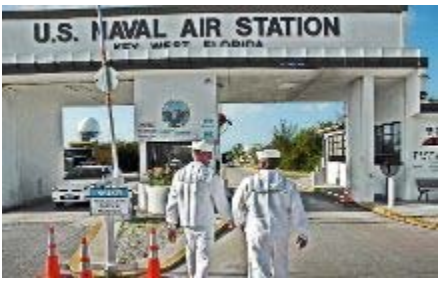
Air Traffic Controllers walk to the main gate.