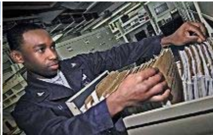
Personnel Specialist sorts through service records