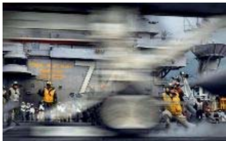
Lieutenant Commander signals a launch as an F/A-18F is catapulted from the flight deck of a carrier.