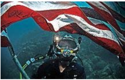
Petty Officer assigned to Mobile Diving Salvage Unit