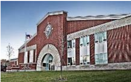
Exterior view of the new Atlantic Fleet Drill Hall