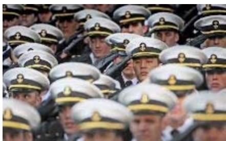
Navy midshipmen render honors during the National Anthem.