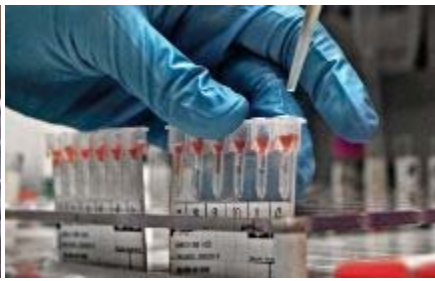
The Naval Medical Center San Diego (NMCS) Blood Bank