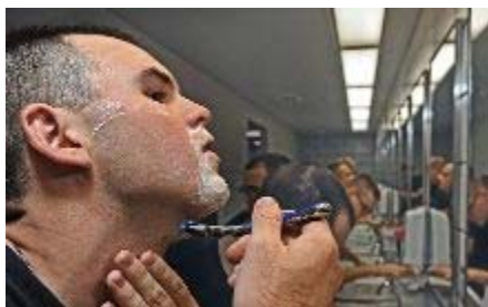
Sailors undergo a transformation from civilian to sailor in just over eight weeks.