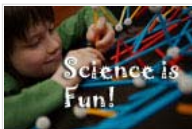
Science is Fun!