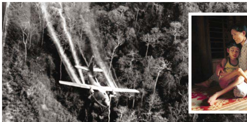
Up to 4 million Vietnamese may have been affected by American wartime defoliant spraying.

Like a widely cited 1974 National Academy of Sciences study on Agent Orange, the