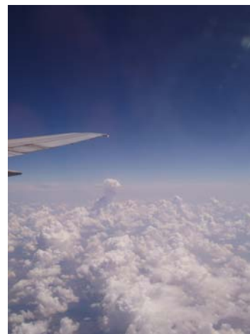
Real clouds (like sheep!). Notice the demarcation line and the inky blue sky above.