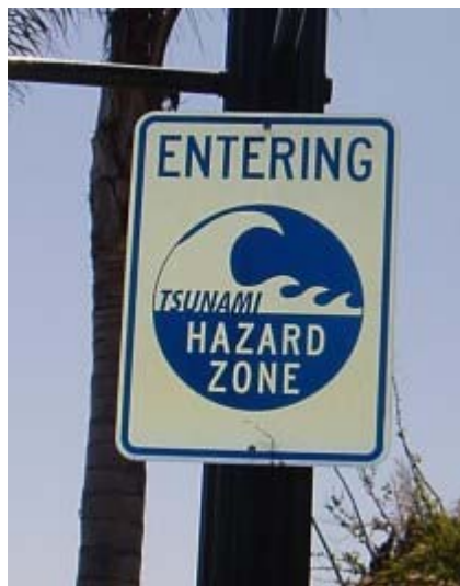
Will the dreaded "Big One" (earthquake) create a tsunami in this part of Southern California?