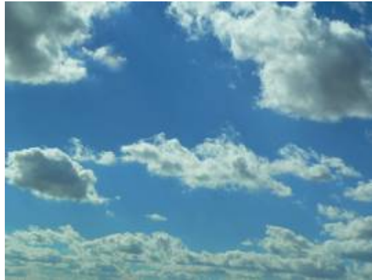
Clouds need moisture to form!

CONTRAILS typically form behind high-flying jets in a low-humidity environment. Cold, dry conditions -- exactly those found in the upper atmosphere -- are prerequisites to contrail formation. The humidity level of the upper atmosphere is LOW, which is the reason clouds form in the troposphere -- the lower portion of our atmosphere. Jet contrails, which occur at high altitudes (e.g., 40,000 feet) disappear quickly -- much like your breath on a cold winter day. They are simply made of water vapor .