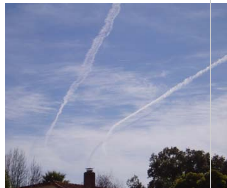
See the "cloud cover" forming in what began as a clear day. And since when have passenger jets traveled in curved paths? (Click to enlarge)

However, as even a fool knows, loss of sunlight means plants cannot make food (remember photosynthesis?), and plants feed the entire food chain. So the spraying is blocking the sun, and a planet with less light will allow MOLDS and FUNGUS to grow (see our Morgellons page for more on artificial fungus).