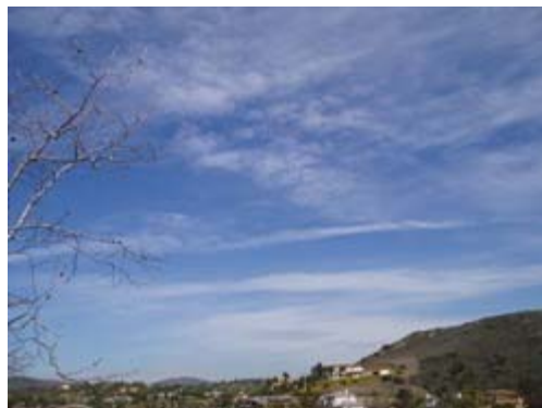
A blanket of clouds sprayed by airplanes!

The lesson: Clouds and contrails require opposite conditions to form! Don't forget this.