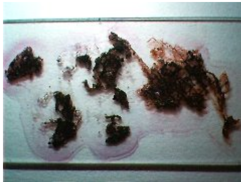
Dried gum/dental sample after wine test

The Red Wine Test is fast becoming a popular Morgellons-fiber detection test. Brush teeth first; then use a 5-minute rinse (or as long as possible) of 1/3 3%-hydrogen-peroxide and 2/3 merlot red wine. Spit into cup and observe presence of fibers. (For those who prefer not to use alcohol, organic purple grape juice works as well or better -- use 2/3 juice and 1/3 peroxide.) Testers have noted the inorganic, crystalline structure of particles in the cup.