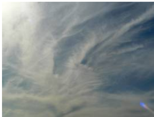
These are artificial clouds

Spraying "clouds" above us to save us from global warming is a poor [future] excuse for a program that is presently being denied. As one studies the nature of chemtrails and their content, the dawning that this is deliberate begins to form. Not only are we losing our light (and plants support the entire food chain by making food from sunlight), but we are breathing and absorbing materials that are intrinsically changing our biochemistry. (See http://www.carnicom.com/ for blood and skin analyses.) Metal particulates in the air we inhale have displaced oxygen. In addition to our air being conductive, we ourselves are electrically charged -- and therefore conductive.