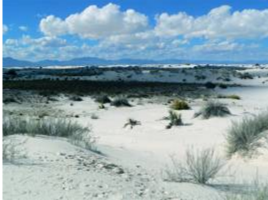
These are real clouds

Geo-engineering is defined as the large-scale manipulation of the earth's environment to suit human needs and "promote habitability." Once a controversial field, scientists around the world are now recruited and paid to develop methods of geo-interference to affect our climate and topography in the effort to mitigate the current "global warming crisis." Popular belief has it that our planet needs to be cooled because the CO 2 we have so carelessly created by burning fossil fuels is warming the planet and destroying the protective layer of ozone above us. We must deflect that hot sunlight away from us!