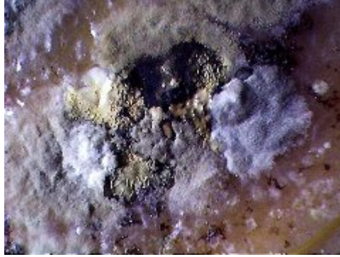
Fungus/bacteria cultured from saliva, 5x magnification

To the right is a culture produced from a fiber-containing saliva sample ( see full report at Carnicom website ). Apart from fibers, the nanopathogens showing up in biological life (plants, animals, humans) appear to be in the form of an artificially engineered fungus. It may be that the cultures produced from dental/gum/saliva samples will lead to more information.