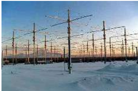
HAARP in Alaska

"Cloud seeding" or the making of rain by spraying silver iodide has been admitted to for quite some time. See The Science Channel documentary "Owning the Weather" (2005). What is not admitted is the extent to which military and government are employing advanced electromagnetic and other technologies to create and alter weather as we are experiencing it today. Originally devised as a weapon against enemy nations, wartime weather manipulation has been secretly used, and in recent years Senate bills have been continually presented for "experimentation" with what we have all taken for granted as being an indelible part of nature.