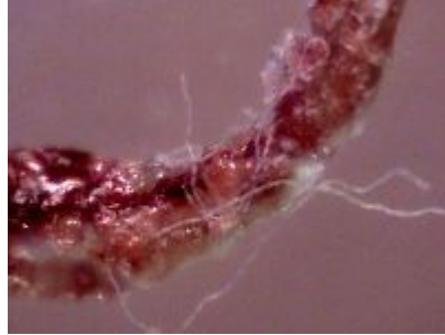
Fiber at 60x magnification

From the Jeff Rense website ( www.rense.com ): Morgellon's Disease, April 2007 "A communicable nanotechnology invasion of human tissues in the form of self-assembling, self-replicating nanotubes, nanowires, nanoarrays with sensors, and other nano configurations, some carrying genetically altered and spliced DNA/RNA. These nano machines thrive in alkaline pH conditions and use the body's bio-electric energy and other (unidentified) elements for power. There is some evidence that these tiny machines possess their own internal batteries. They are also believed to be able to receive specific tuned microwave, EMF and ELF signals and information. To what end is not known.