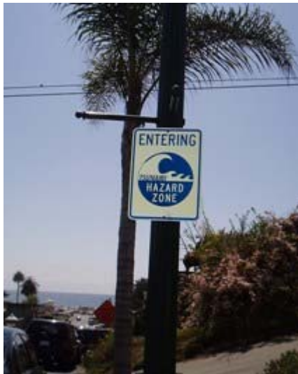
These signs have been placed along the San Diego coastline. The San Andreas fault lies offshore.

In the photos below, notice the very pale sky. Years ago, the San Diego sky was as rich as the blue in the pictured signs. See how the sky whitens at the horizon. You are looking at a concentration of descending metallic particles reflecting the sun.