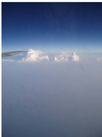
A mound of real cumulus over an opaque shroud below. The earth is surrounded by "haze."