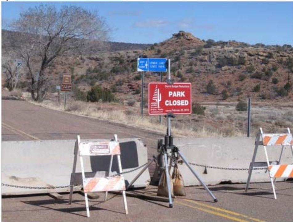
Arizona State Parks Lyman

Lake State Park is closed but is scheduled to reopen from May to September.