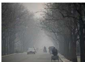
Cars and tricycles can be seen along a road on a hazy day in central Beijing March 4, 2009. In recent ...