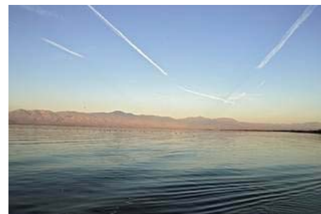
Sun rises over the Salton Sea hitting the mountains on the sea's northwest side.

Comments(15) Recommend(1) Print this page E-mail this article Share Type Size A A A