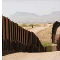
Homeland Security Stands by Its Fence