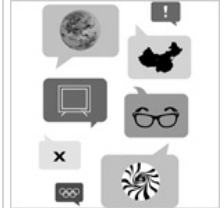
Op-Ed: China's Class Divide