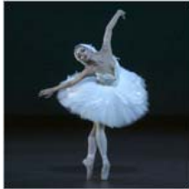
This Season, a Return of Old Friends