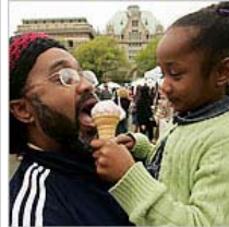
Treats for the Treasure Hunters