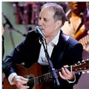
An Outsider at the Center of a Musical Universe