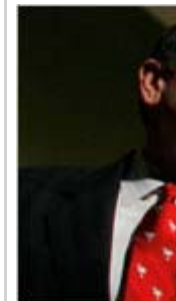
Purple State: Huckabee R

Home | World | U.S. | N.Y. / Region | Business | Technology | Science | Health | Sports | Opinion | Arts | Style | Travel | Real Estate | Automobiles | Back to Top