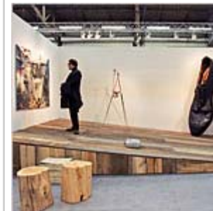
Smooth and Safe at Pier 94