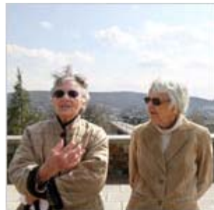
A School Board Clash Pennsylvania