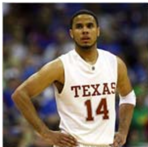
A City Left Behind, but Still Inspired