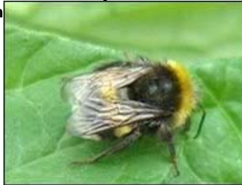
Swift action is needed "to halt the bee decline"

Food production in Northern Ireland could be hit by the decline in the wild bee population, a leading beekeeper has said.