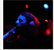
Metal Variety: Death, Doom, Black and Cars

Home | World | U.S. | N.Y. / Region | Business | Technology | Science | Health | Sports | Opinion | Arts | Style | Travel | Jobs | Real Estate | Autos | Back to Top Copyright 2010 The New York Times Company | Privacy | Terms of Service | Search | Corrections | RSS | First Look | Help | Contact Us | Work for Us | Advertise | Site Map