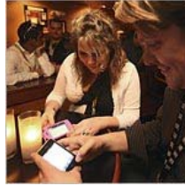
Telling Friends Where You Are (or Not)