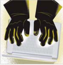
Take This Job and Write It