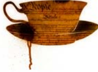
Tea-ing Up the Constitution