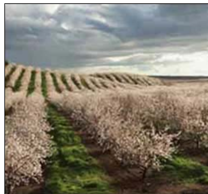
Almond orchard growing in California's great Central Valley.

1900 A.D.: By the 1870s, research and crossbreeding had developed several of today's prominent almond varieties. By the turn of the 20th Century, the almond industry was firmly established in the Sacramento and San Joaquin areas of California's great Central Valley.